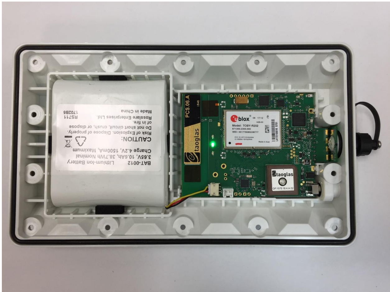
PCB as installed in housing