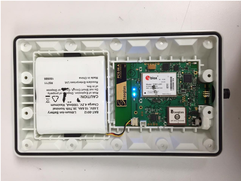
PCB as installed in housing