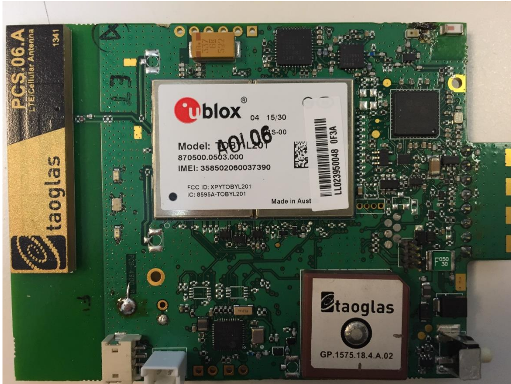
PCB top view