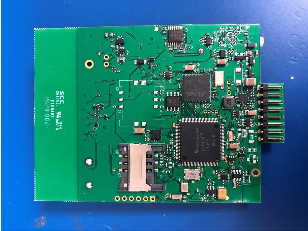
PCB bottom view