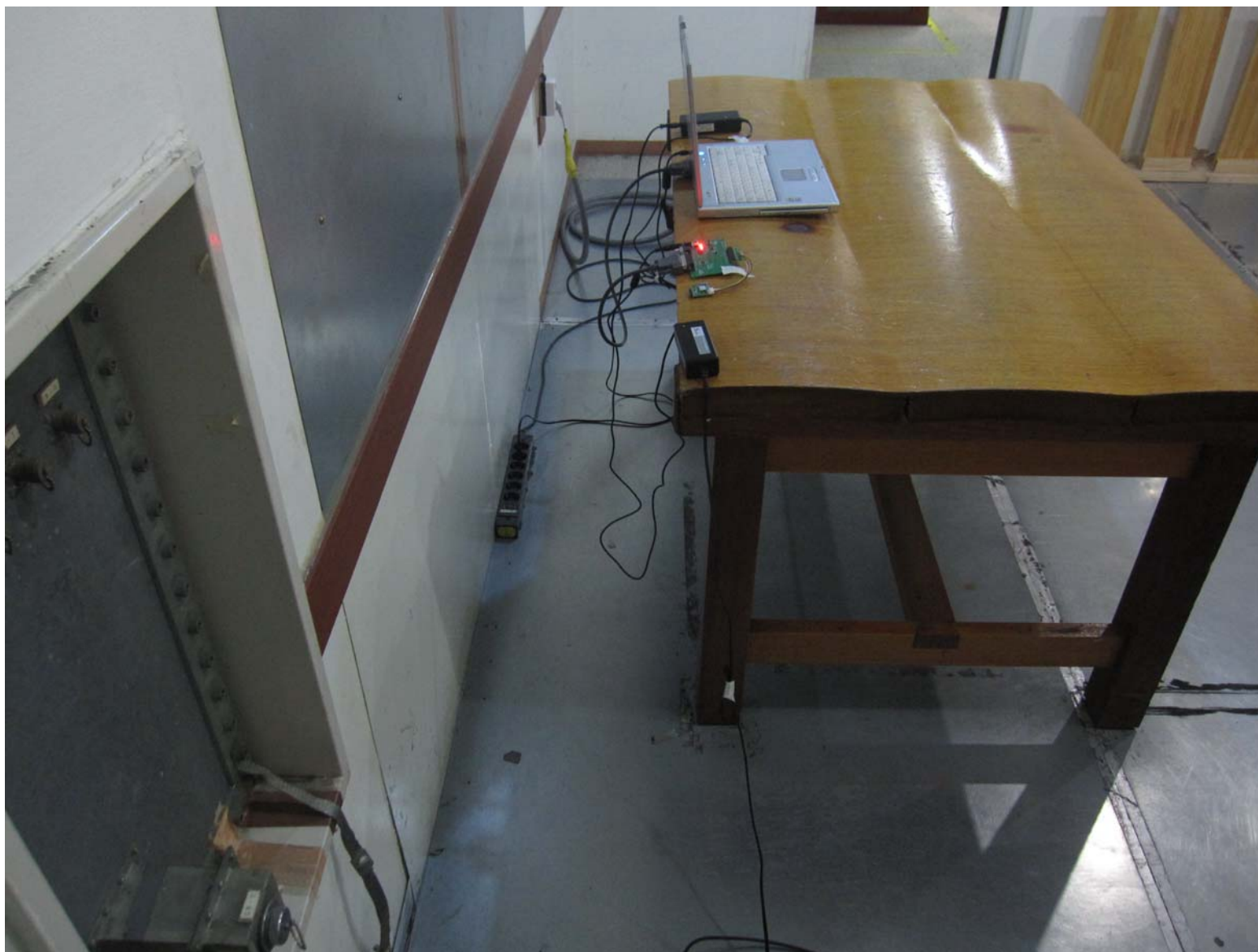
Conducted Emission of rear