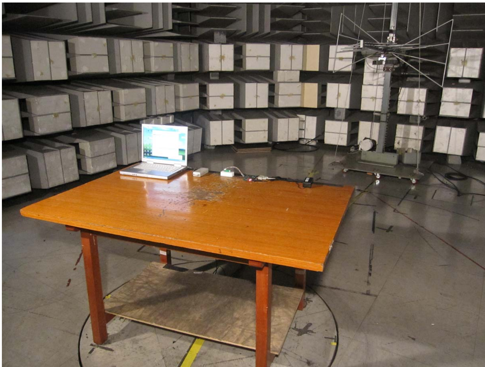
[Radiated Emission] 30 MHz to 1 GHz_Front view