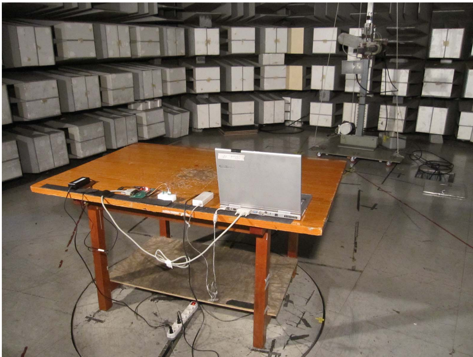
[Radiated Emission] 1 GHz to 26 GHz_Rear view