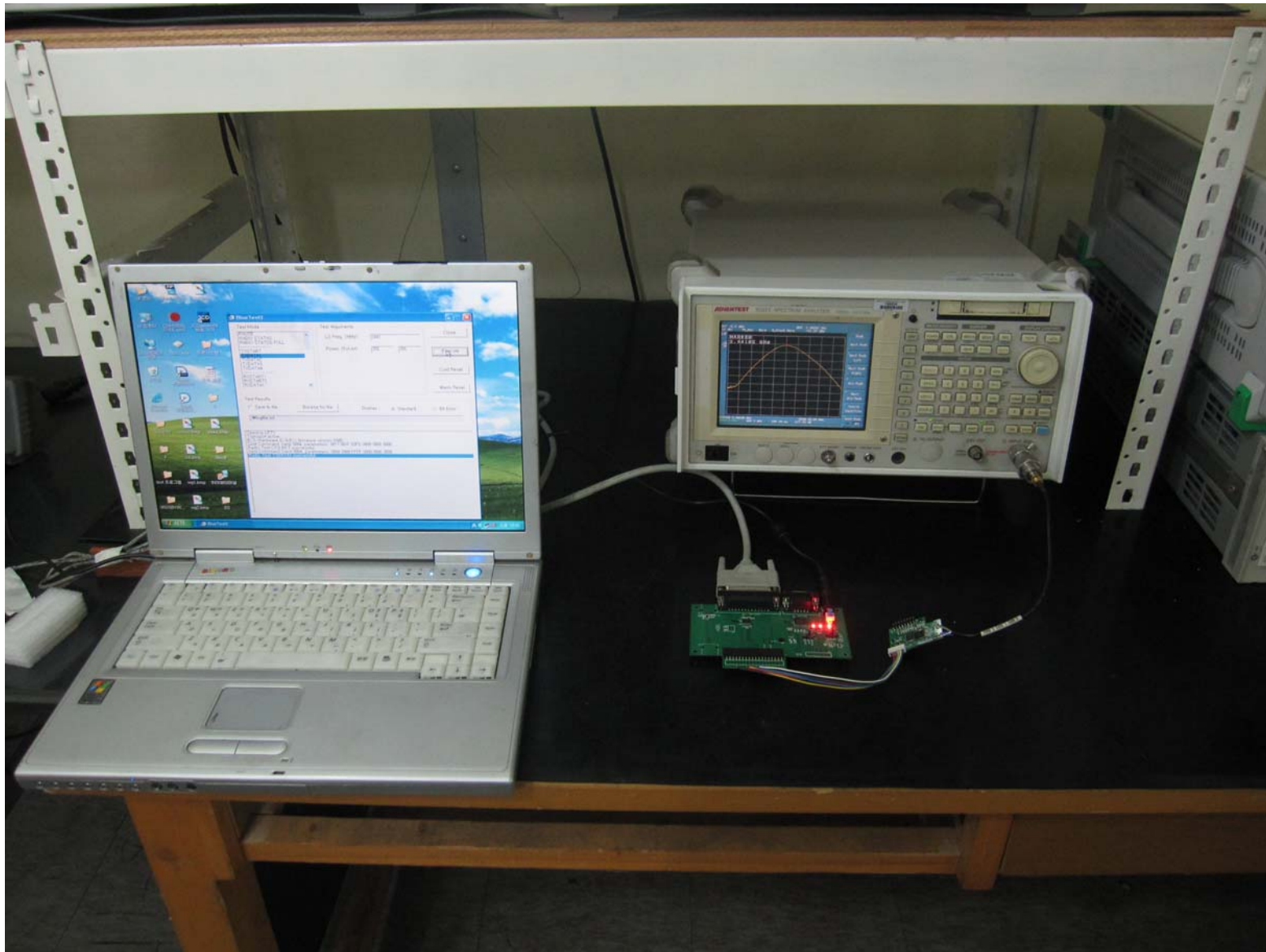
[Conducted Test] Test Setup View