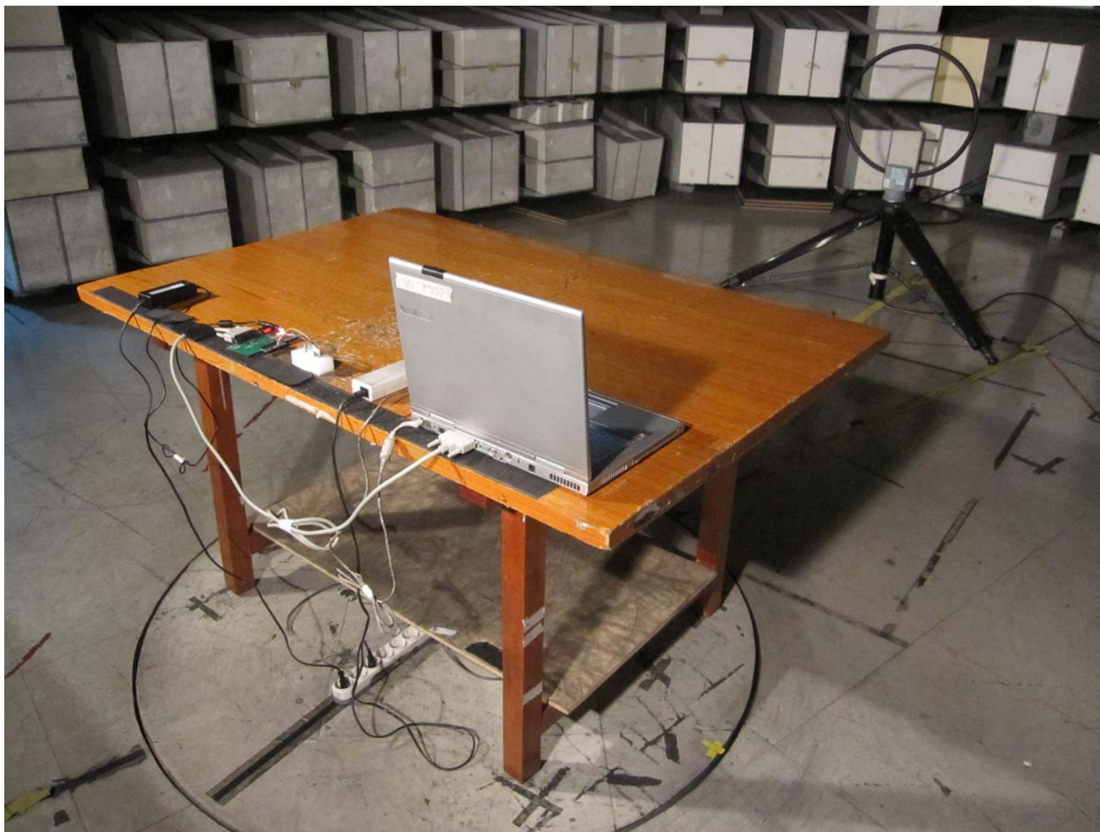
[Radiated Emission] 9 kHz to 30 MHz_Rear view