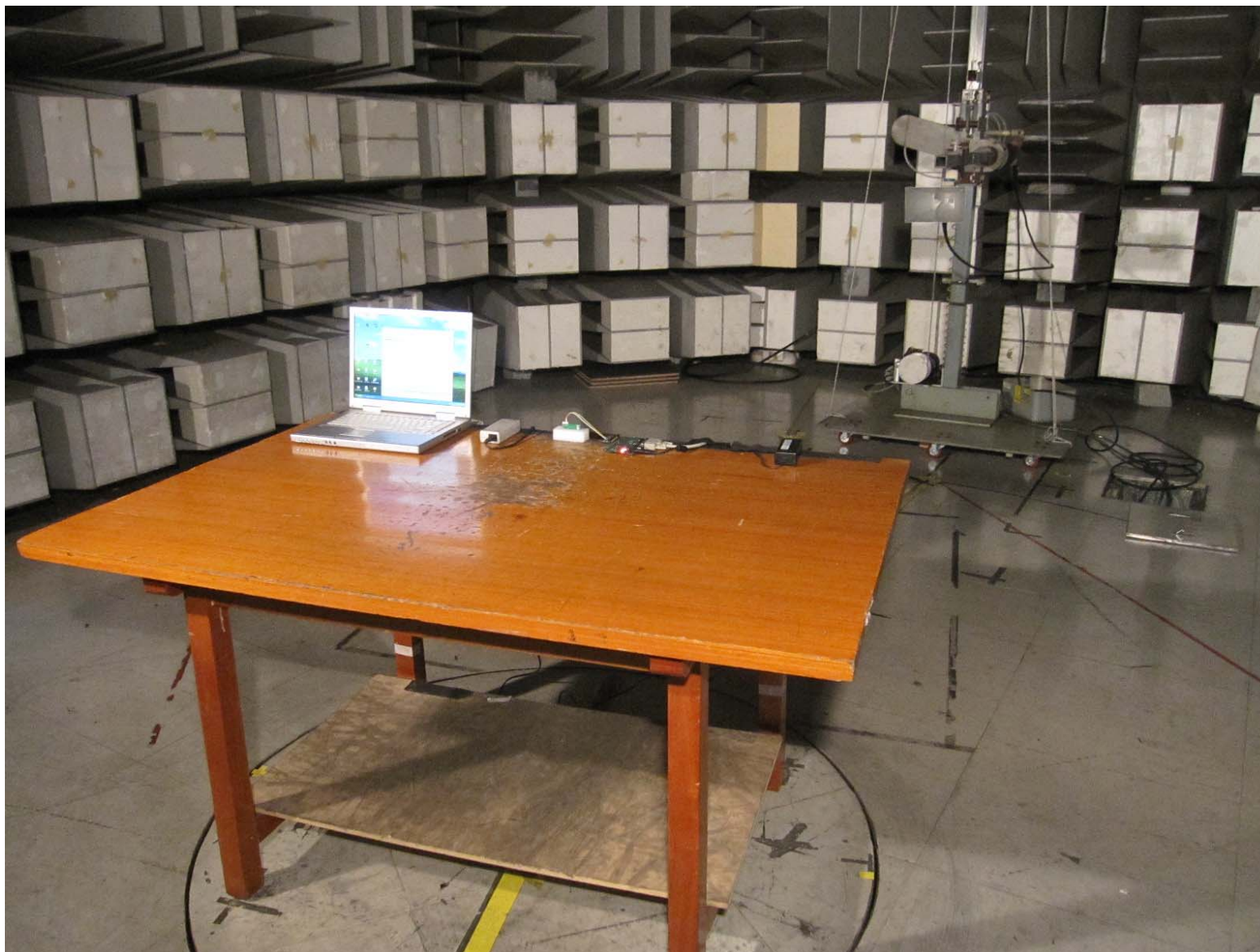
[Radiated Emission] 1 GHz to 26 GHz_Front view