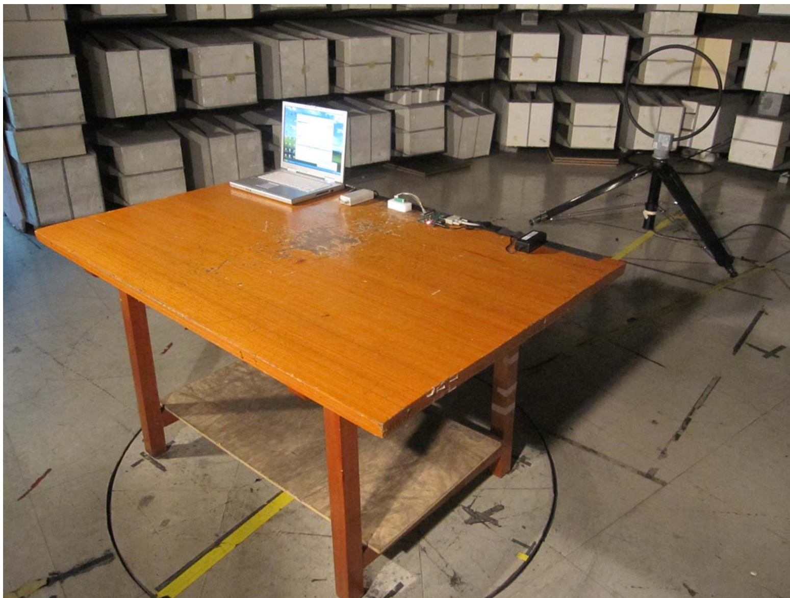
[Radiated Emission] 9 kHz to 30 MHz_Front view