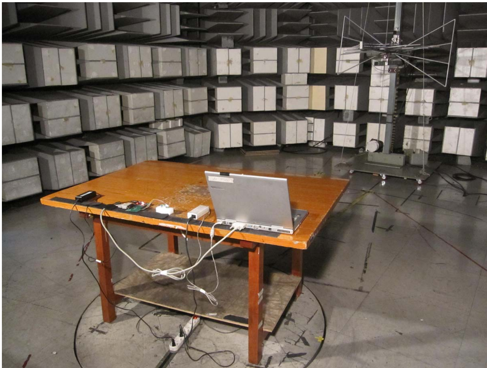
[Radiated Emission] 30 MHz to 1 GHz_Rear view