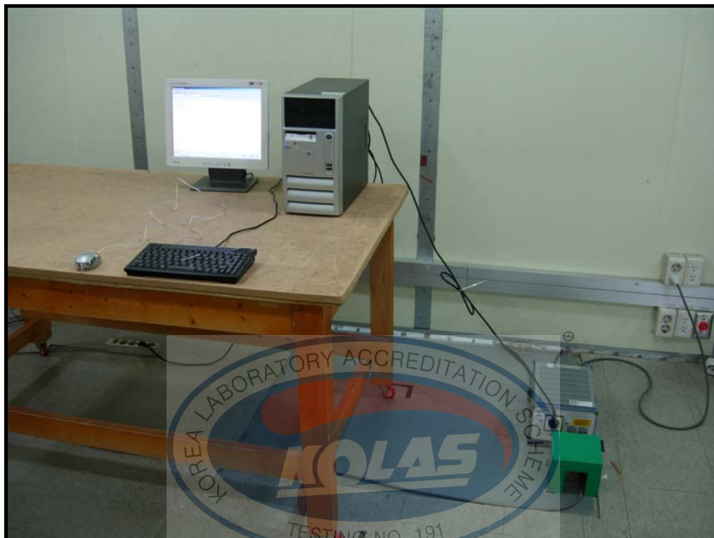
Photograph 1: Setup for Conducted Emissions