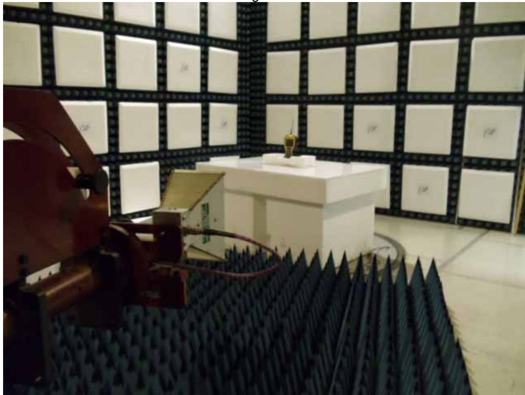
Test Setup for Radiated Emissions – 1GHz to 10GHz, Horizontal Polarization