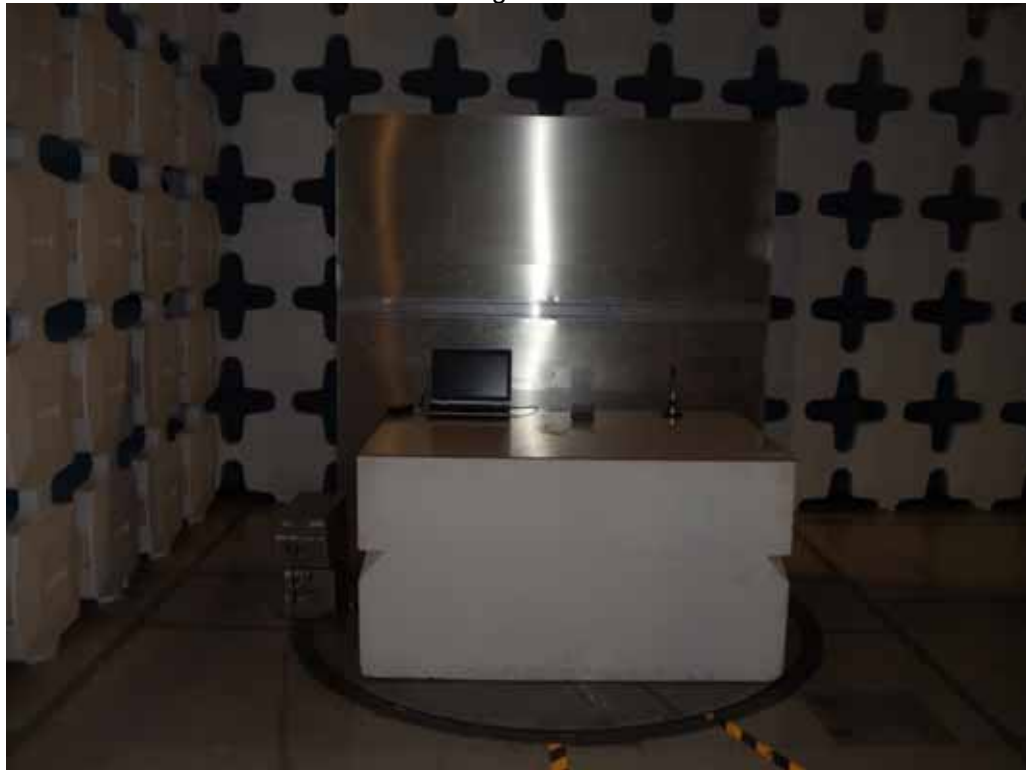
Test Setup for Conducted Emissions