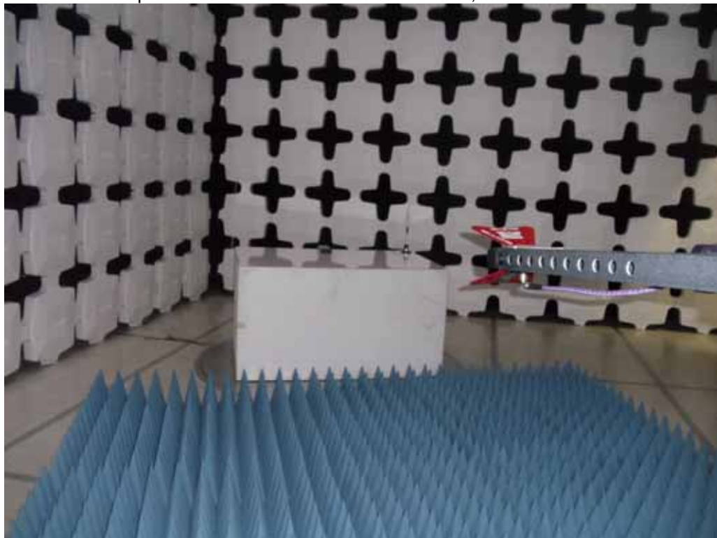
Test Setup for Radiated Emissions – Above 1GHz, Vertical Polarization