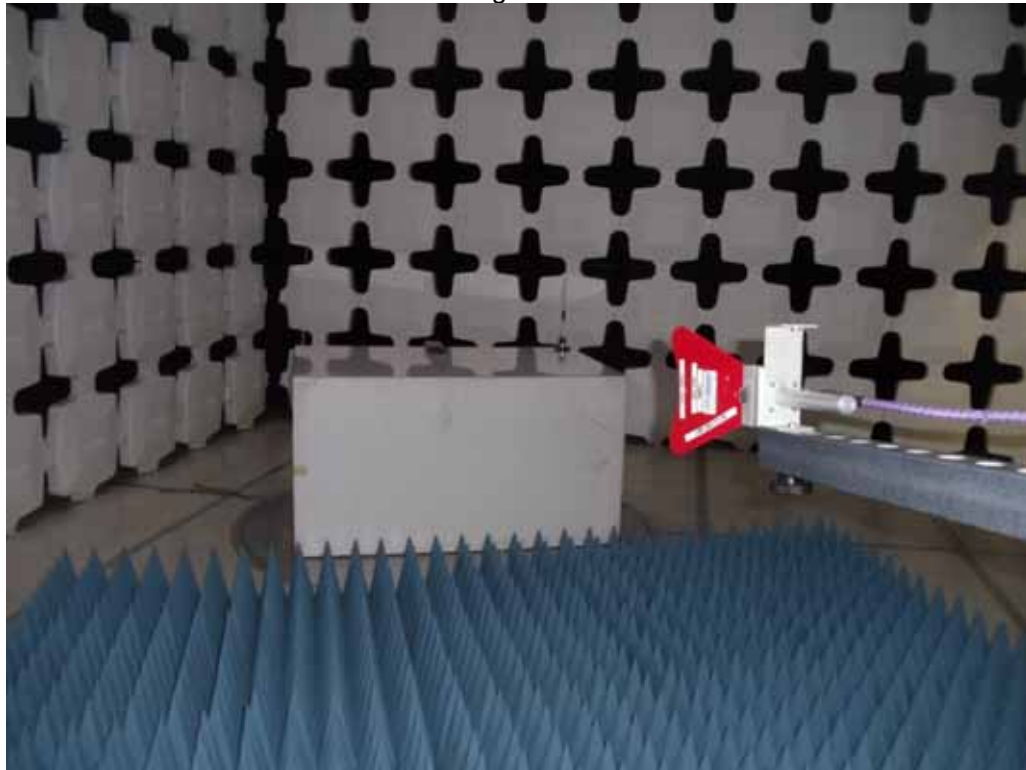
Test Setup for Radiated Emissions – Above 1GHz, Horizontal Polarization