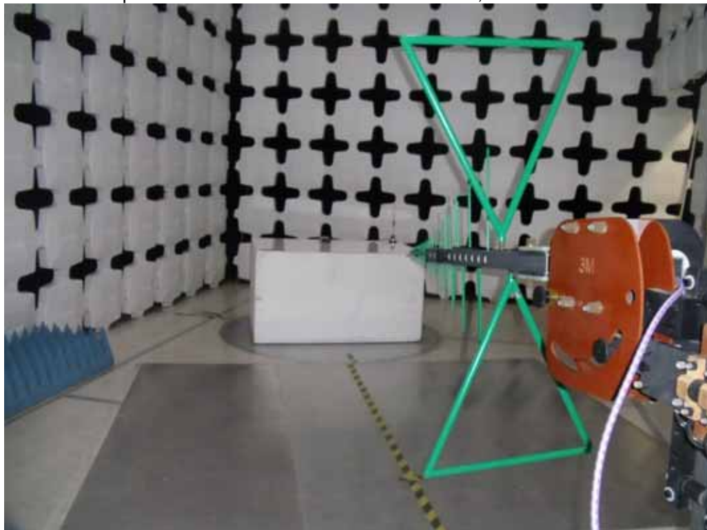
Test Setup for Radiated Emissions – 30MHz to 1GHz, Vertical Polarization