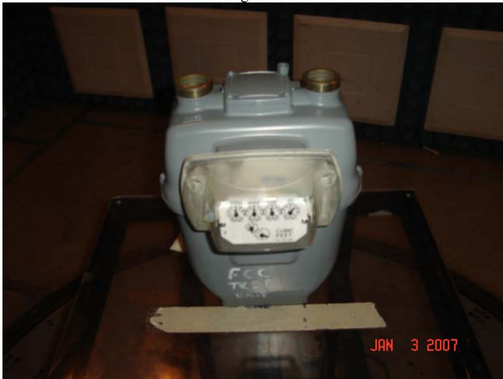
Test Item Set-up