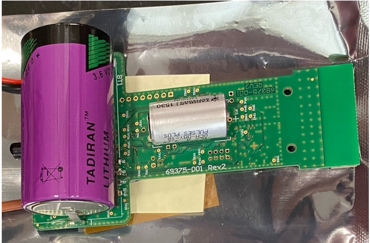
Figure 3 PCBA with batteries installed.