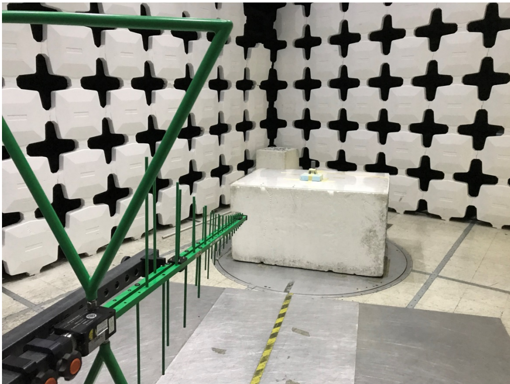
Figure 8 – Transmitter Test Setup for Radiated Emissions – 30MHz to 1000MHz, Vertical Polarization