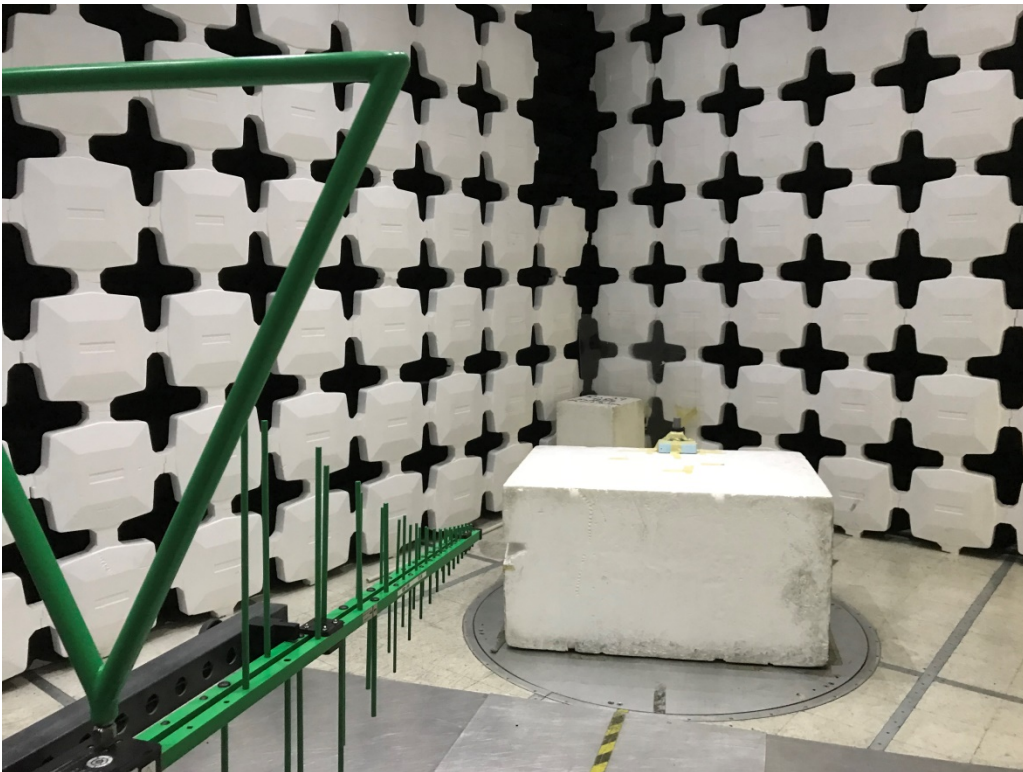
Figure 4 – Receiver Test Setup for Radiated Emissions – 30MHz to 1000MHz, Vertical Polarization