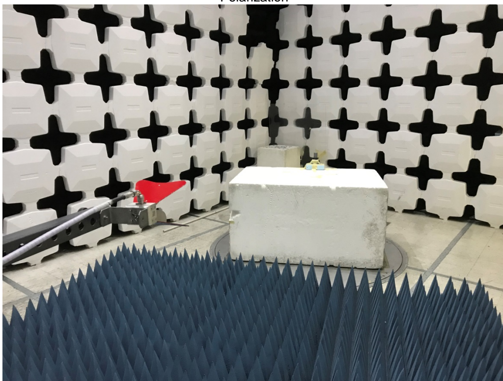
Figure 6 – Receiver Test Setup for Radiated Emissions – 1GHz to 10GHz, Vertical Polarization