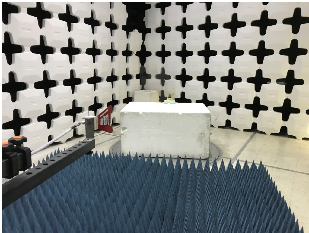
Figure 5 – Receiver Test Setup for Radiated Emissions – 1GHz to 10GHz, Horizontal Polarization