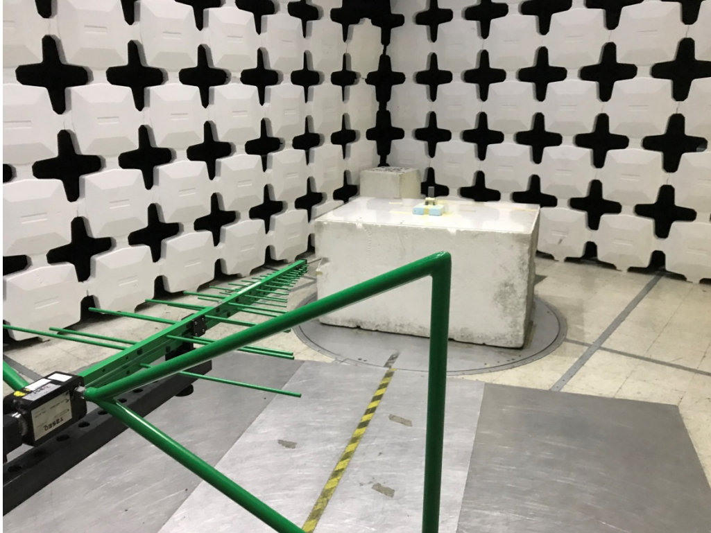
Figure 7 – Transmitter Test Setup for Radiated Emissions – 30MHz to 1000MHz, Horizontal Polarization