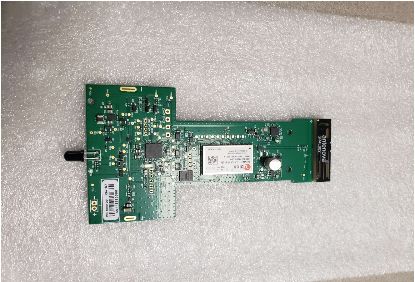
Figure 1 Component side