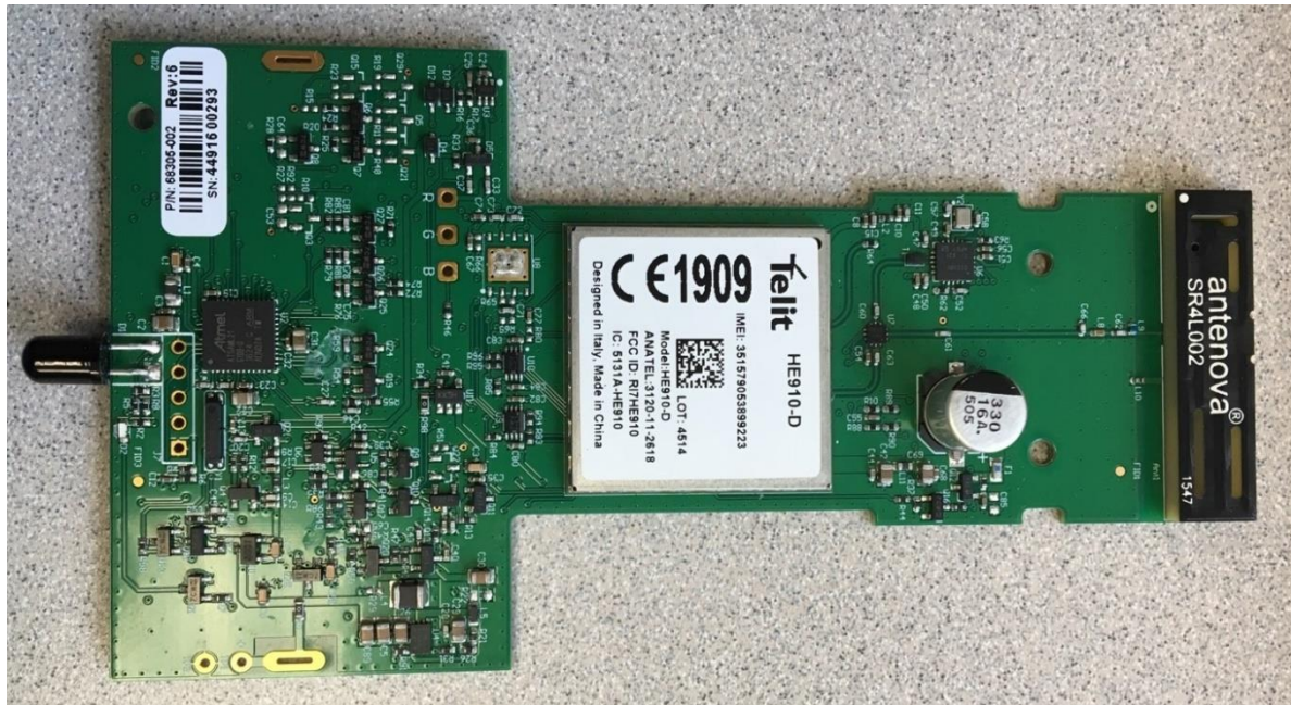
Figure 1 PCBA component side.