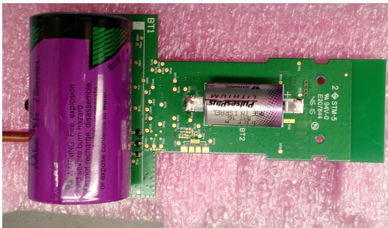
Figure 3 PCBA with batteries installed.