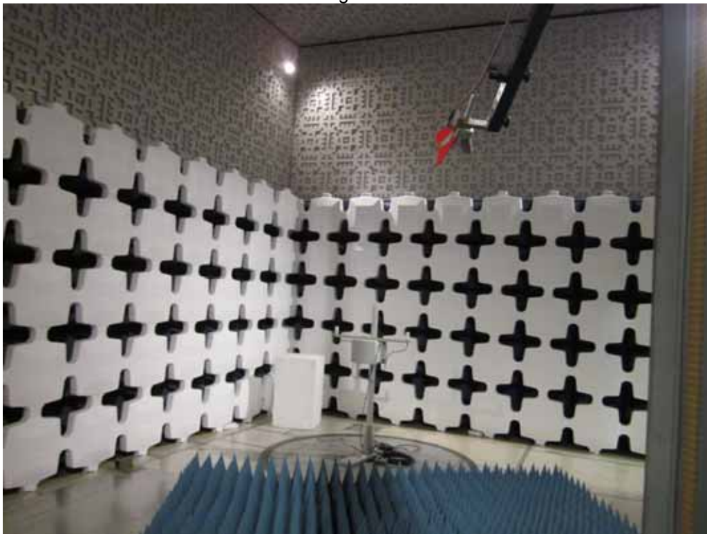
Test Setup for Radiated Emissions above 1GHz – Horizontal Polarization