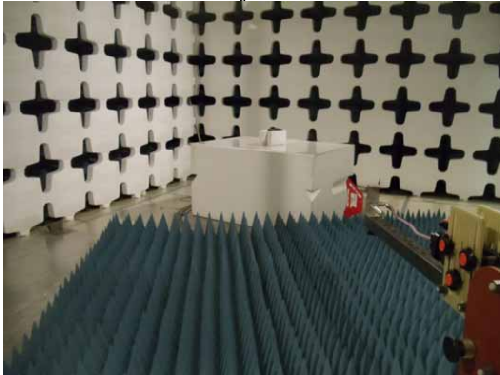
Test Setup for Radiated Emissions – 2GHz to 10GHz, Horizontal Polarization