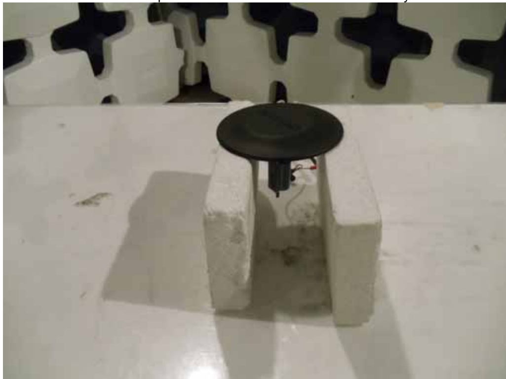
Test Setup for Radiated Emissions – EUT