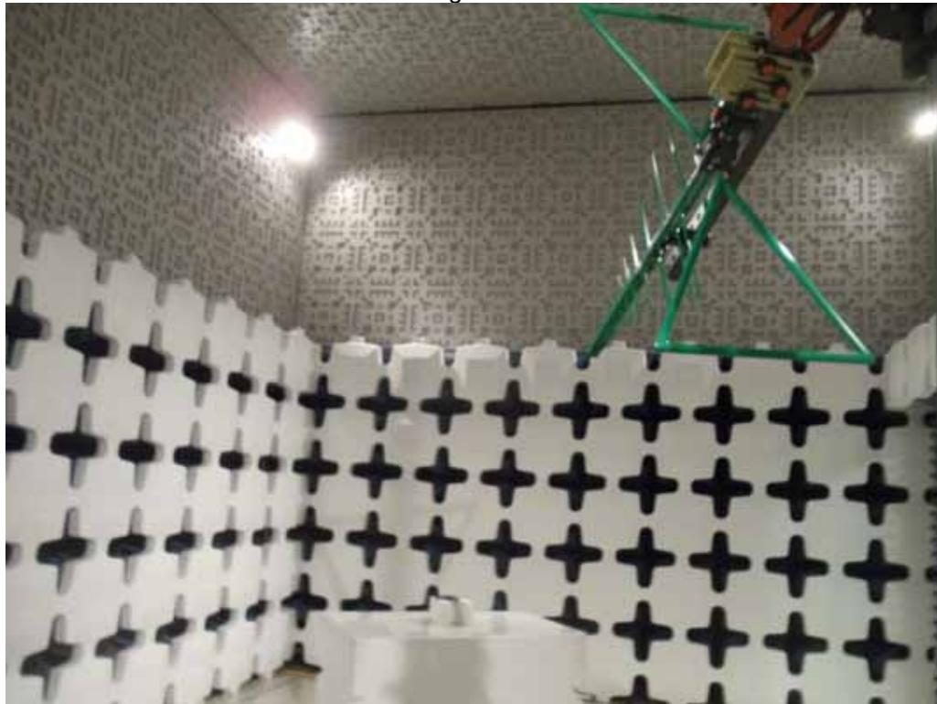
Test Setup for Radiated Emissions – Vertical Polarity