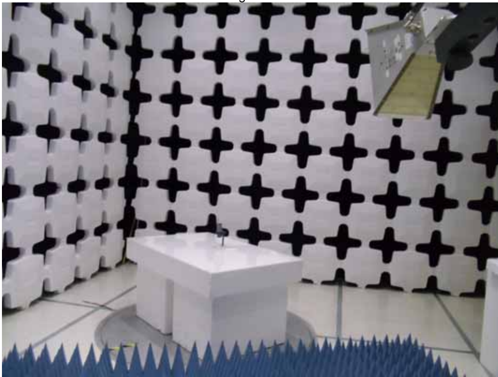
Test Setup for Radiated Emissions, Above 1GHz – Horizontal Polarization