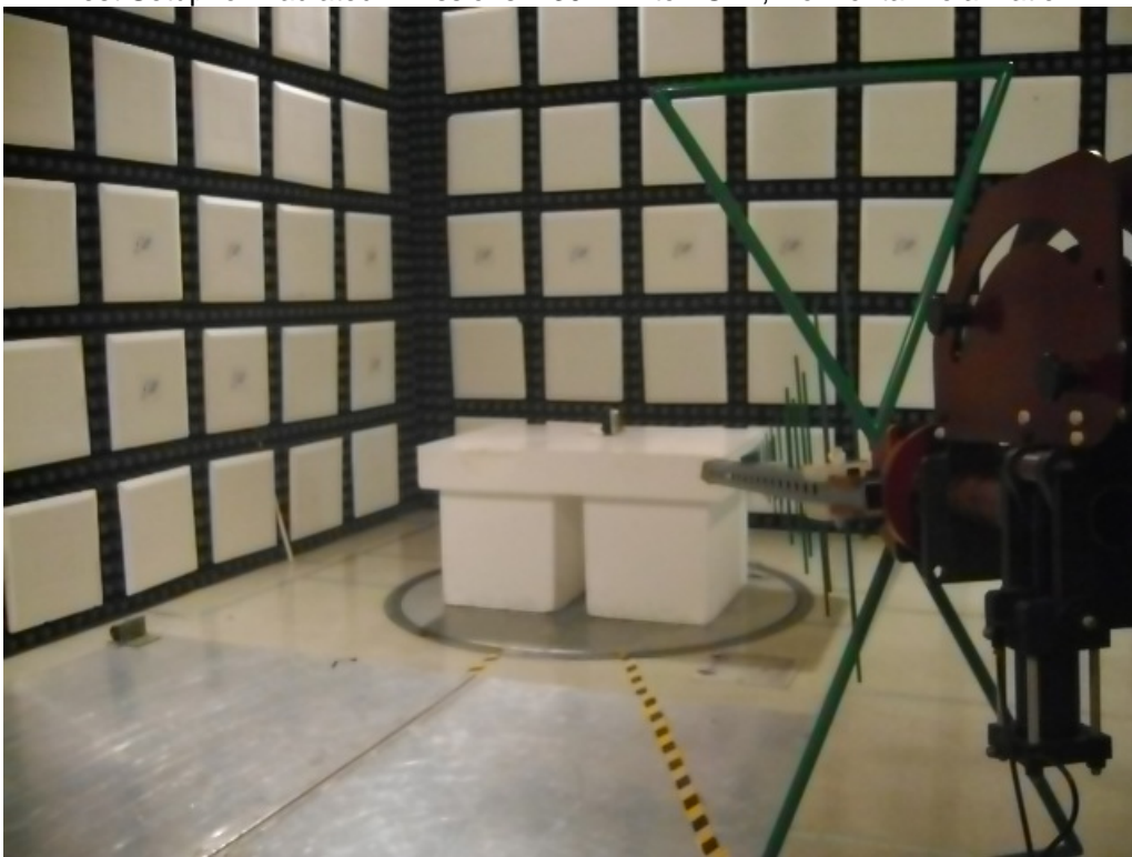
Test Setup for Radiated Emissions – 30MHz to 1GHz, Vertical Polarization