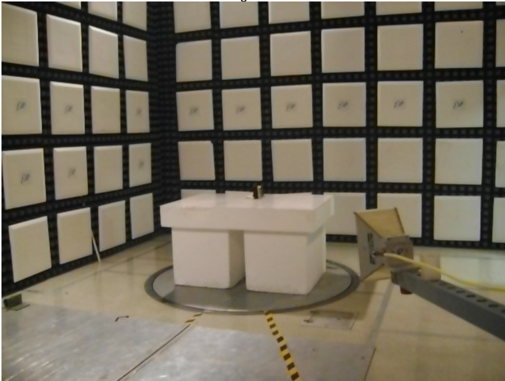
Test Setup for Radiated Emissions – 1GHz to 10GHz, Horizontal Polarization