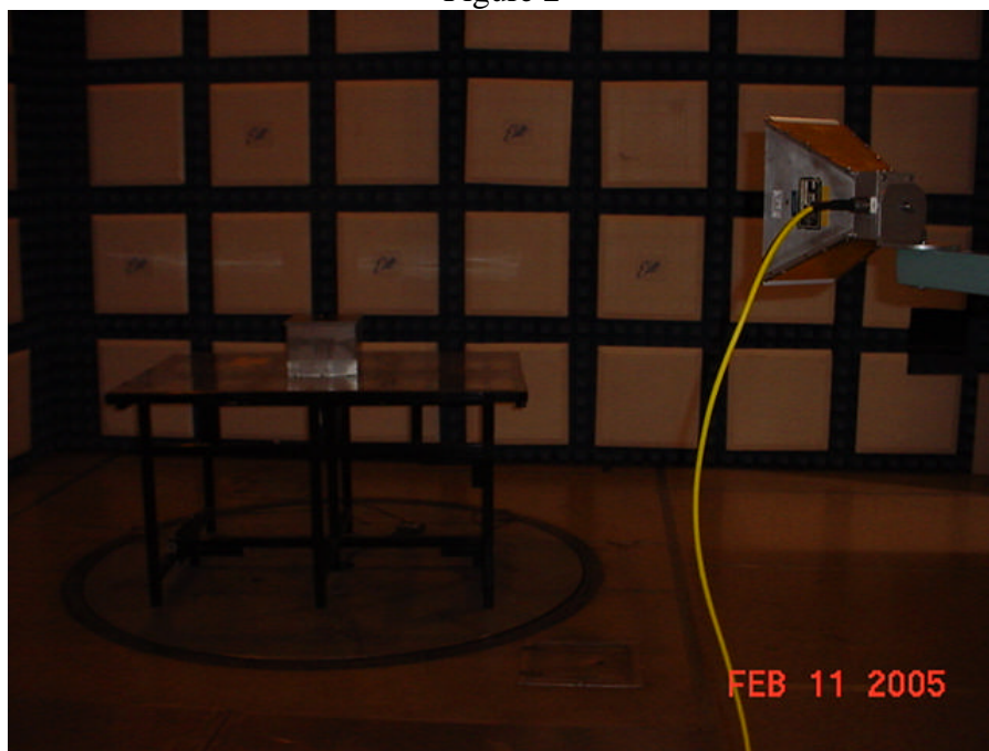
TEST SETUP FOR MEASUREMENT OF RADIATED EMISSIONS, VERTICAL POLARIZATION