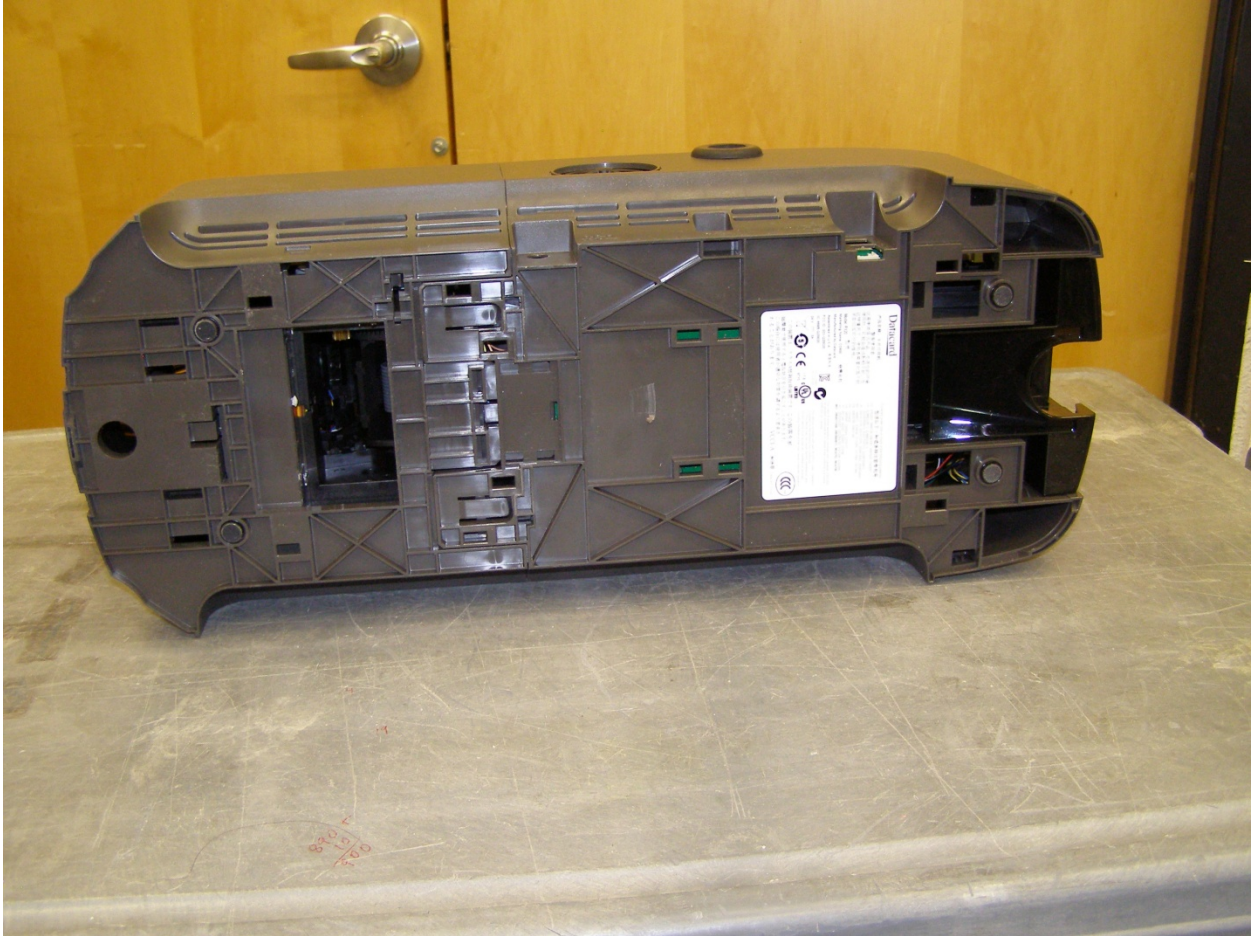
PX30 Label Placement Single Hopper