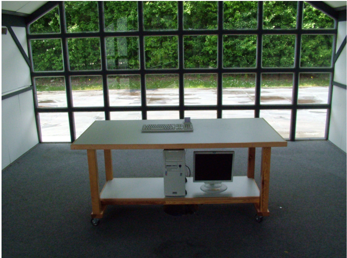
Picture 15-2: EUT test setup open site for spectrum mask and radiated emission test