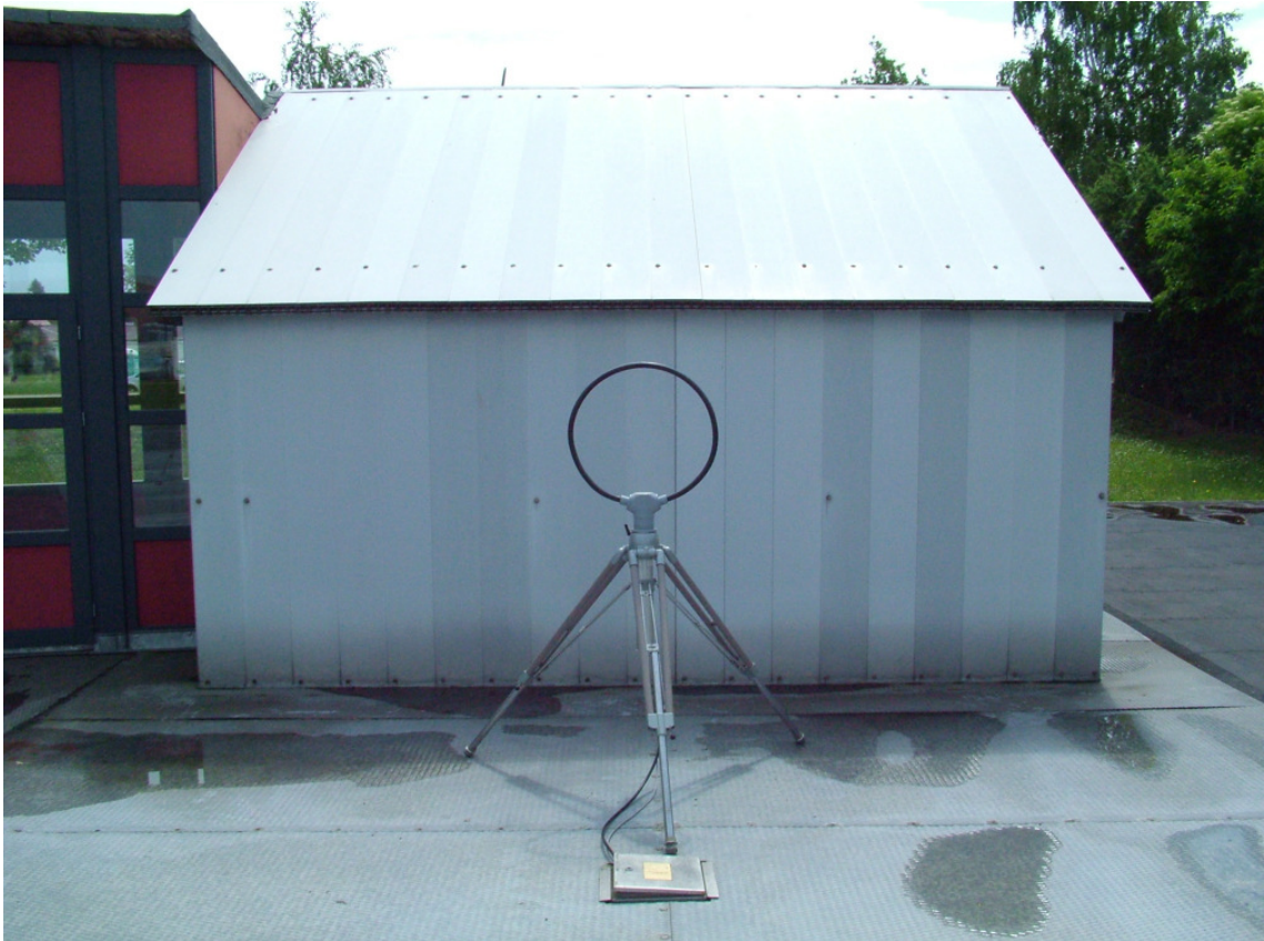
Picture 15-1: Loop antenna on open site 3m for spectrum mask and radiated emission test