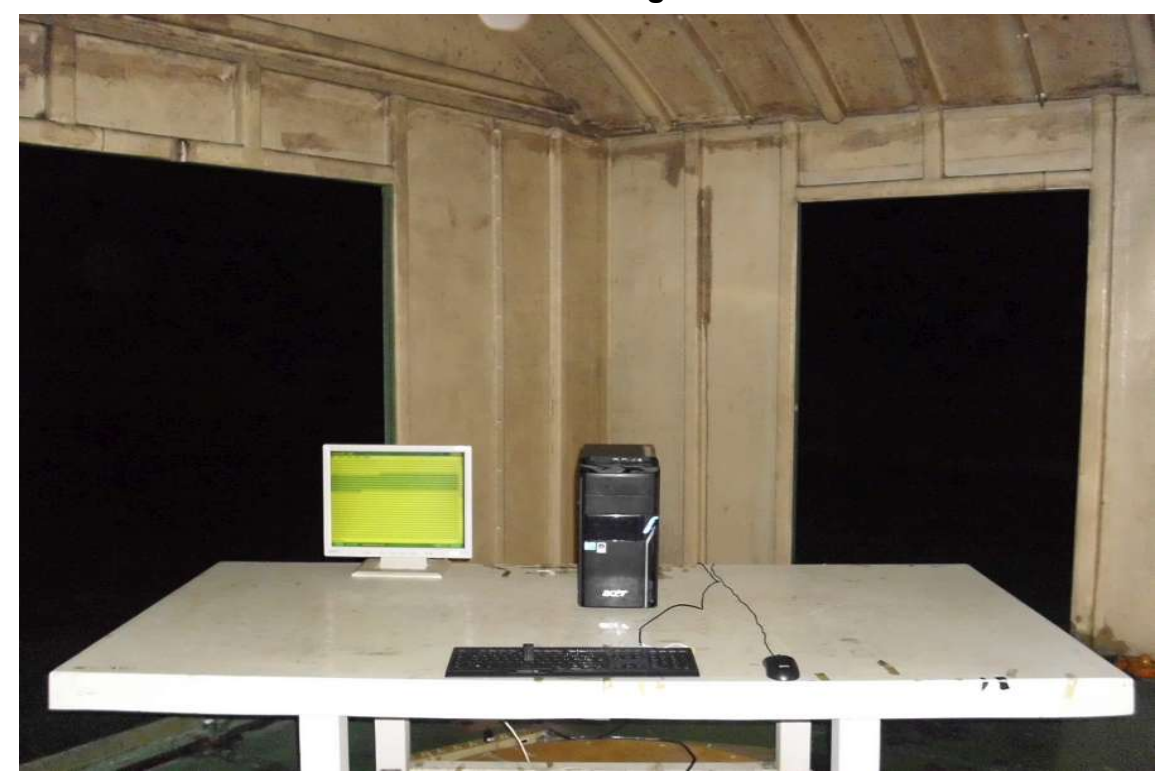
Test Mode: Charge Mode