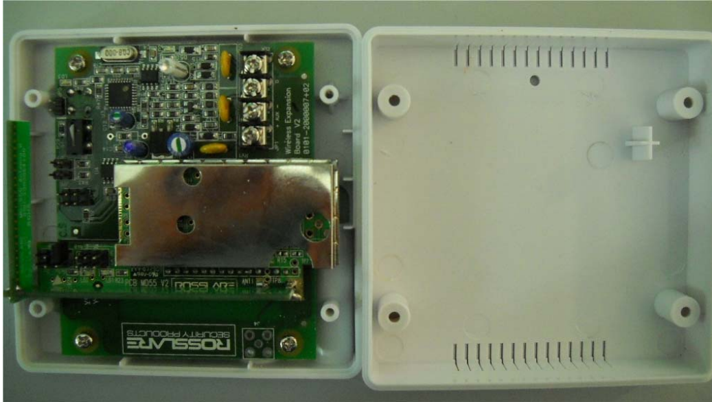
Photograph No.1 XR-16AG wireless expansion internal view