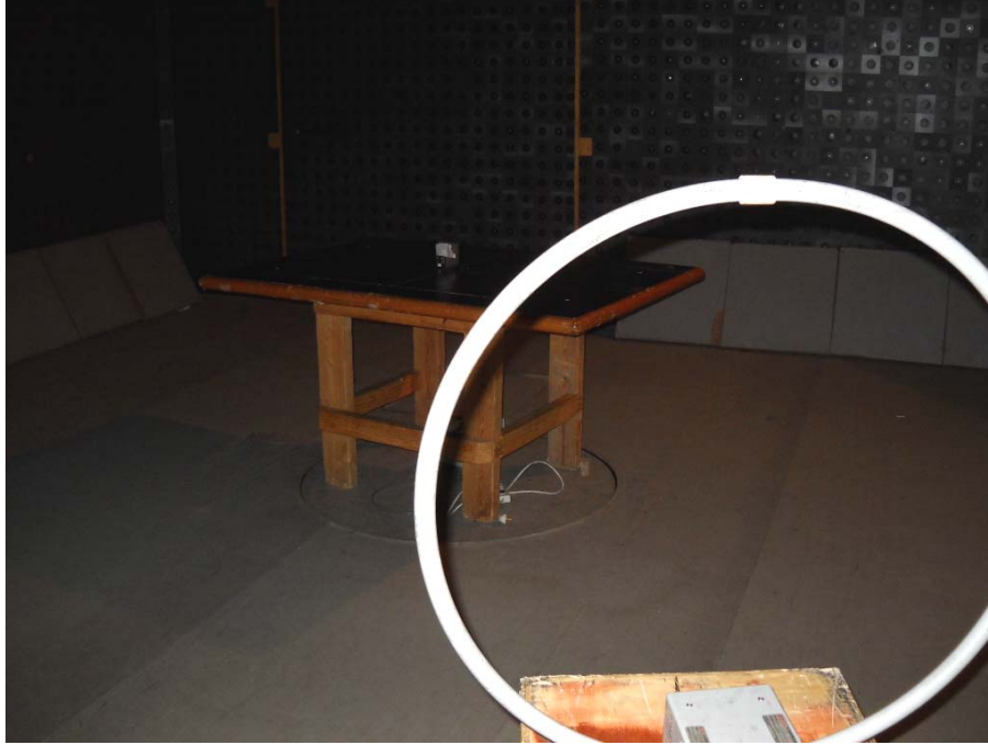
Photograph No.1 Setup for spurious emission measurements in the anechoic chamber below 30 MHz