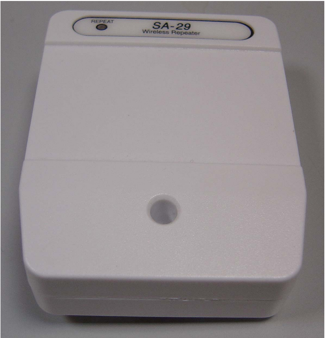
Front and Bottom sides