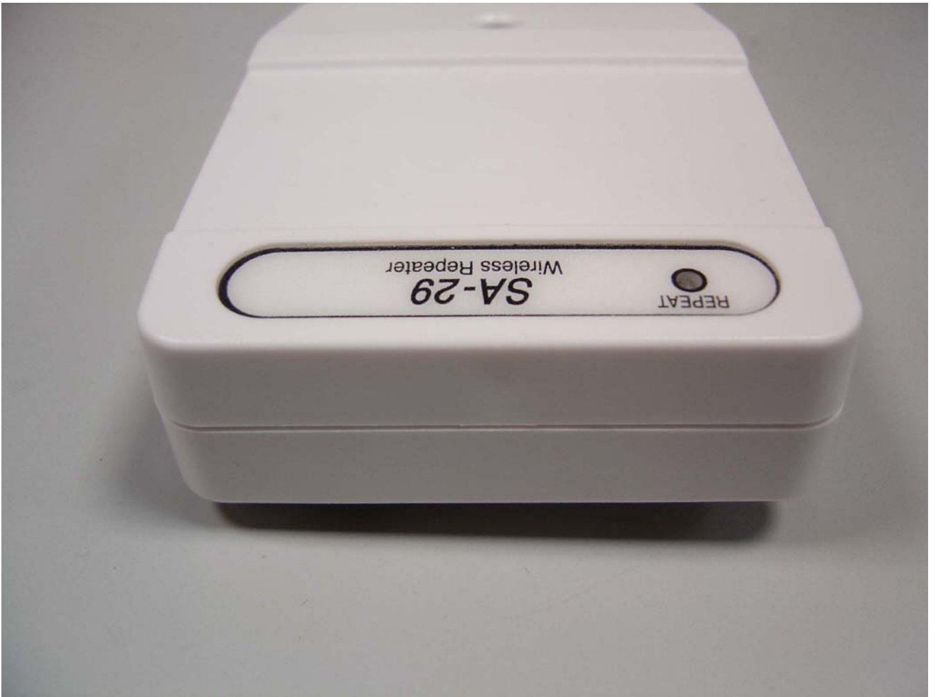
Front and Top side