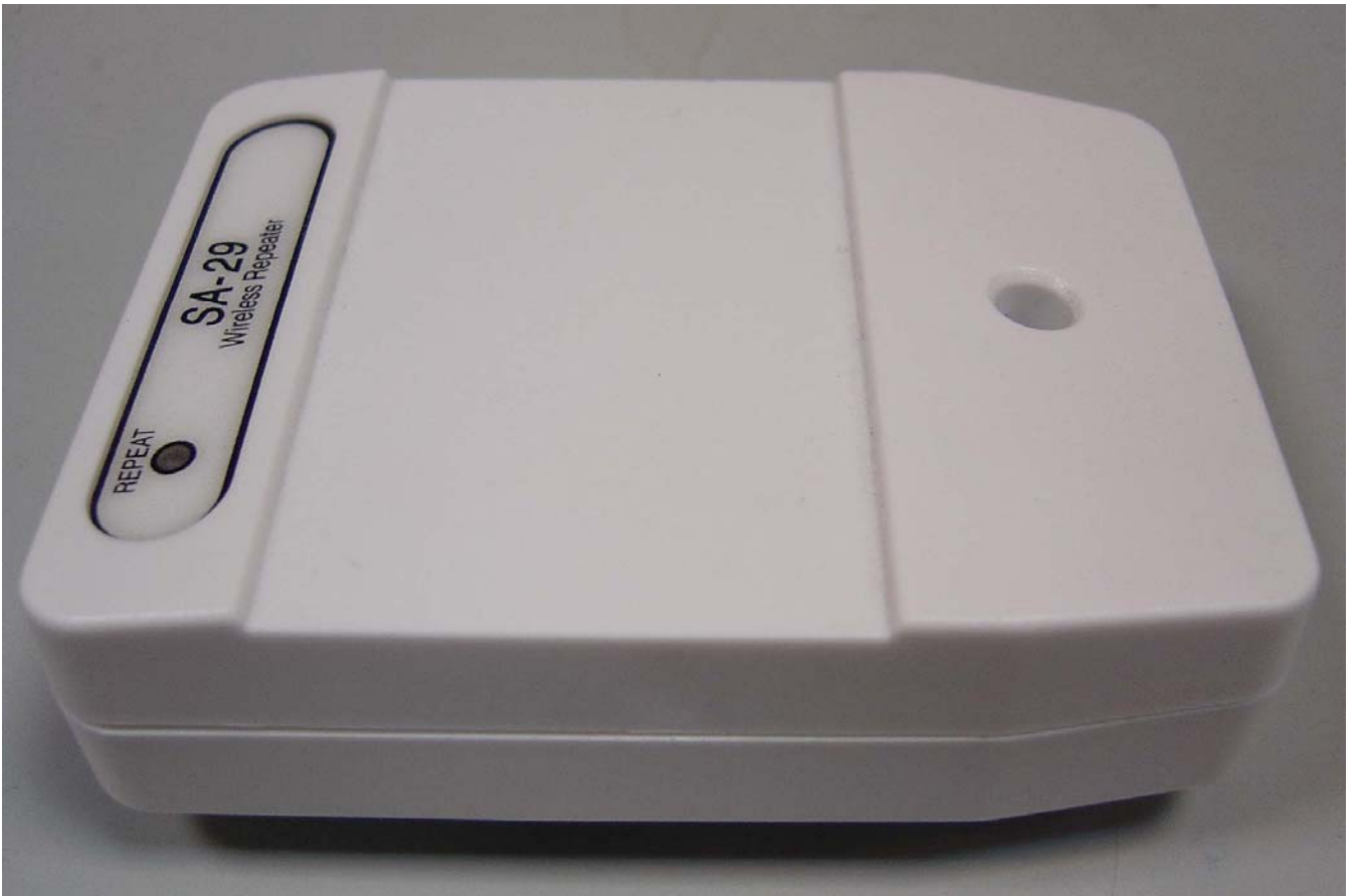
Front and Left side