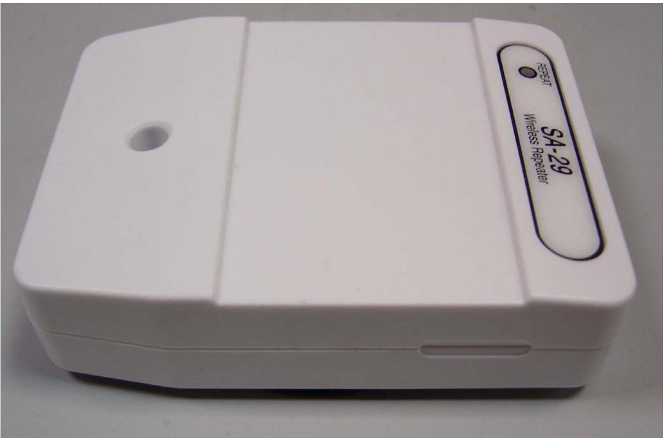
Front and Right side