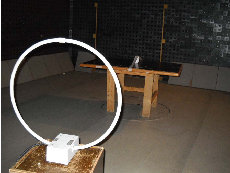
Photograph No.1 Setup for spurious emission measurements in the anechoic chamber below 30 MHz