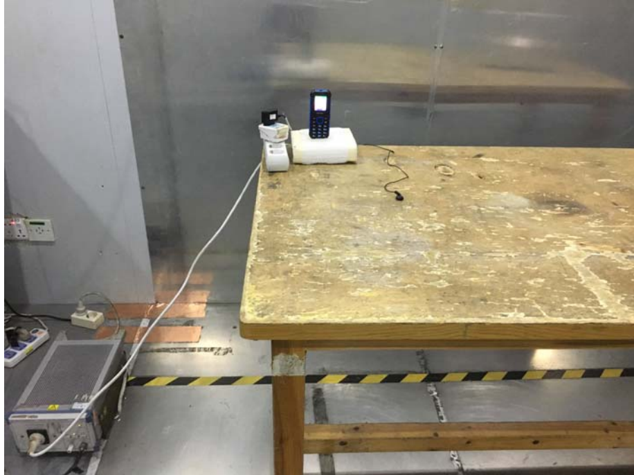
Test Site 1#