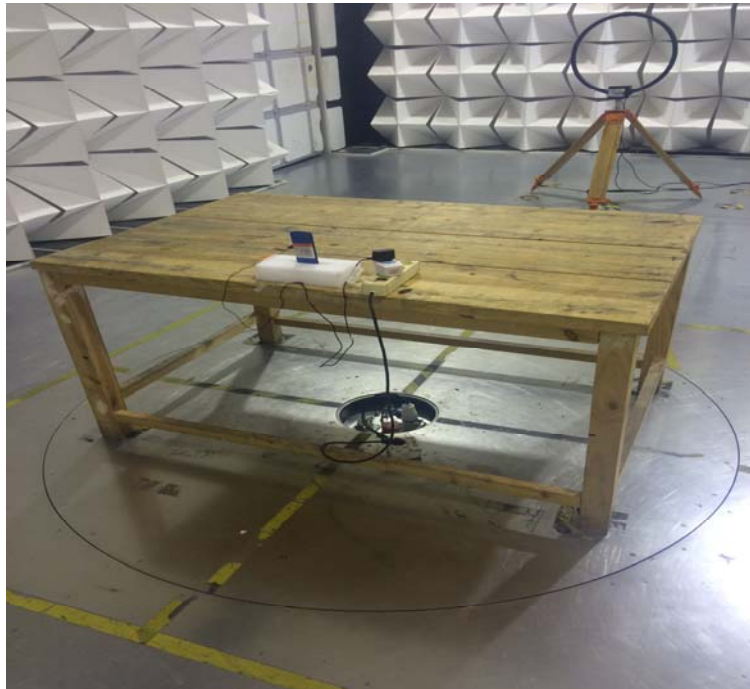
Below 30MHz Test Site 2#