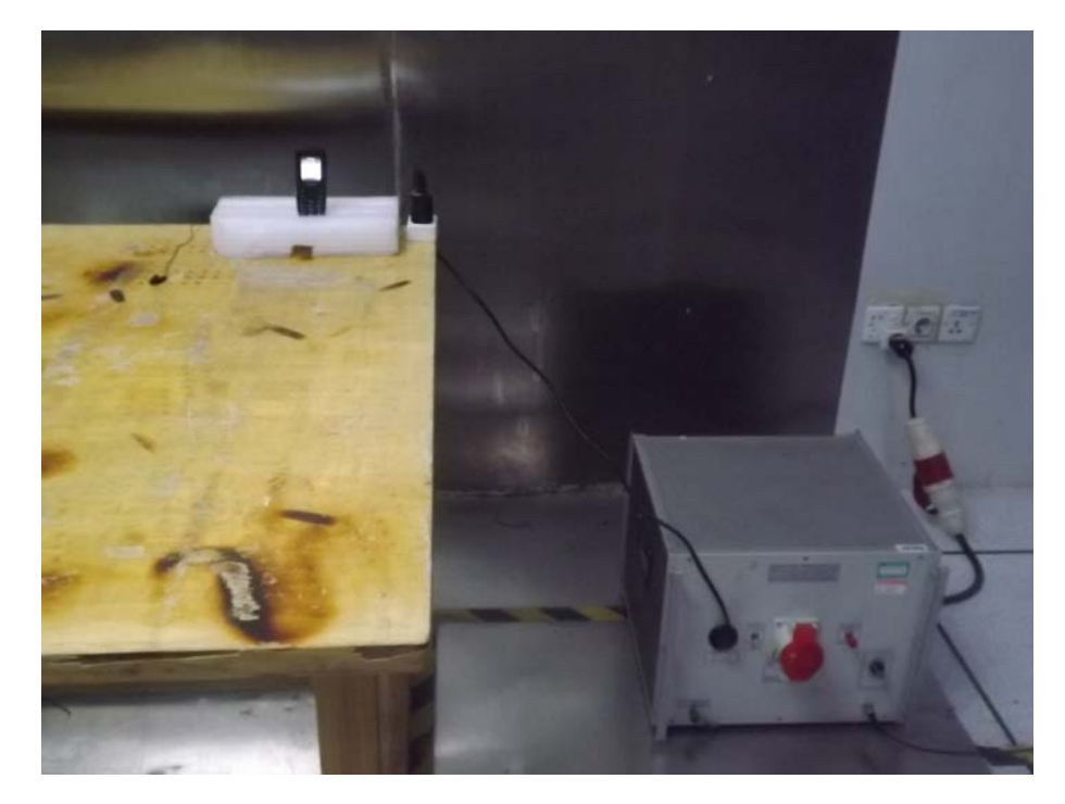
Photograph - Spurious Emissions Radiated Test Setup