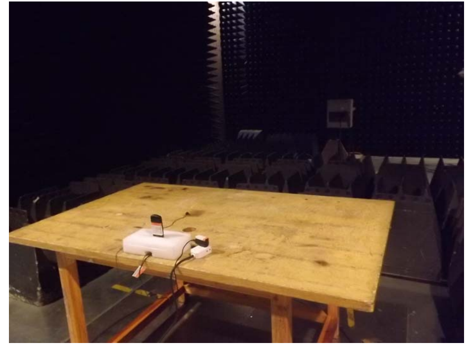
For Above 1GHz Test Site 1#