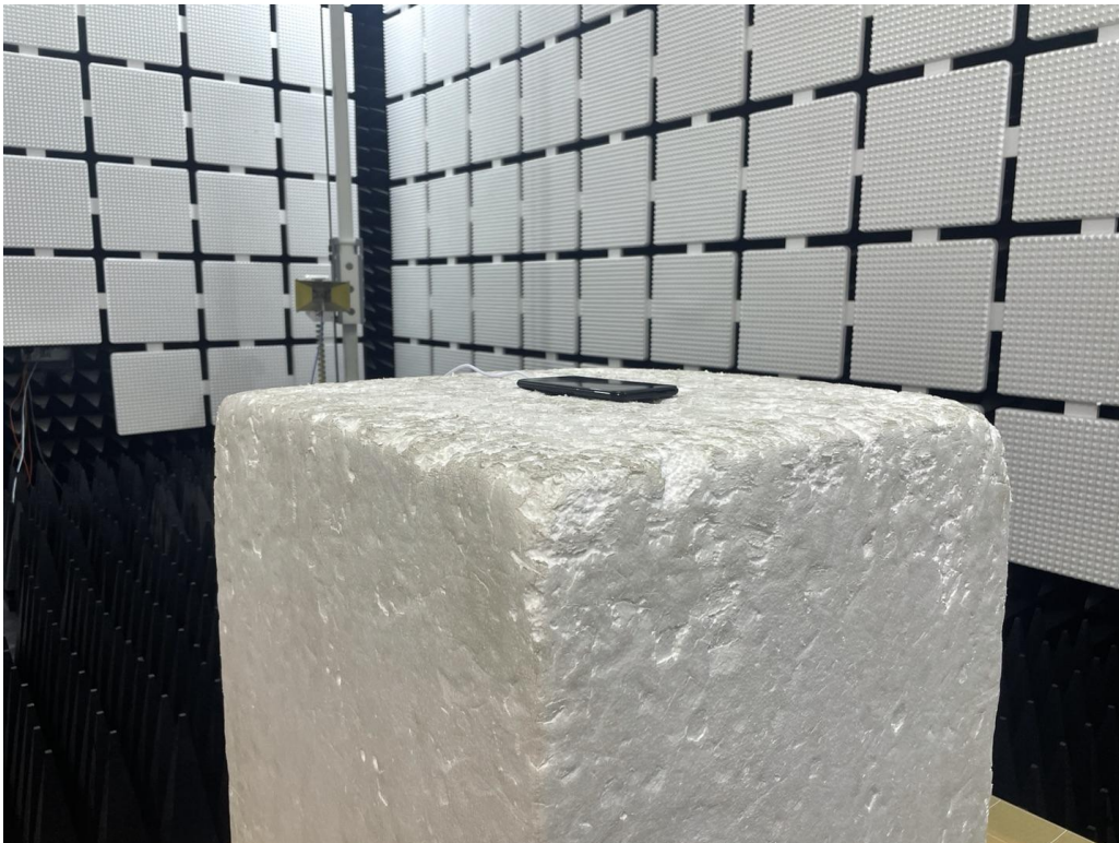
Fig. 2 (Above 1GHz)