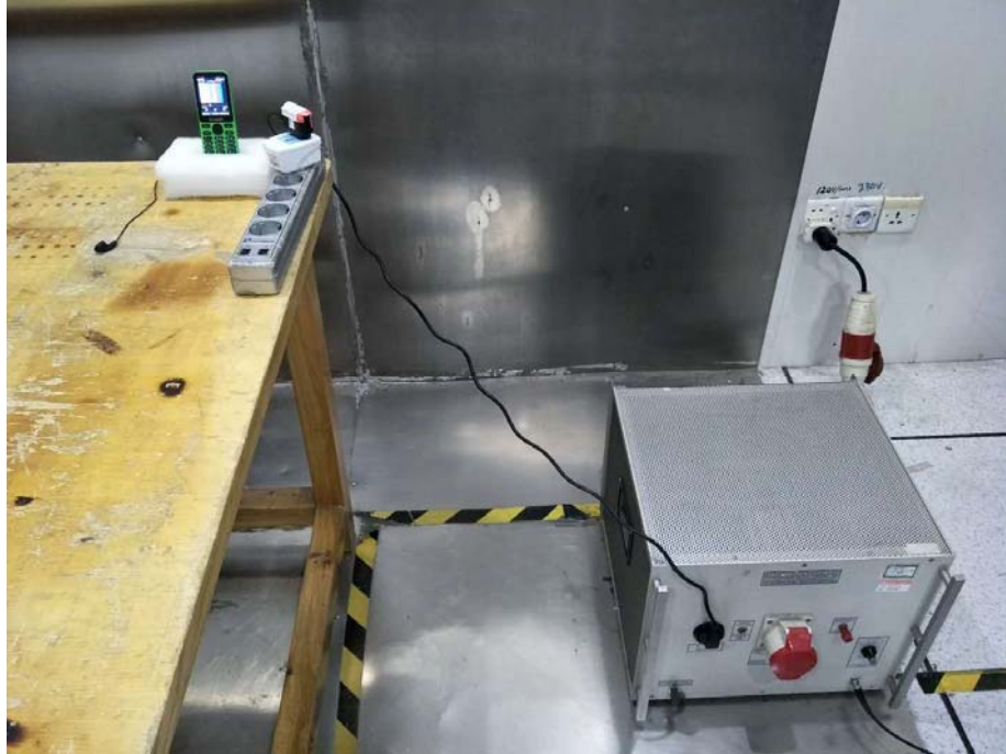
Test Site 1#