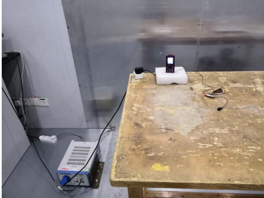
Test Site 1#