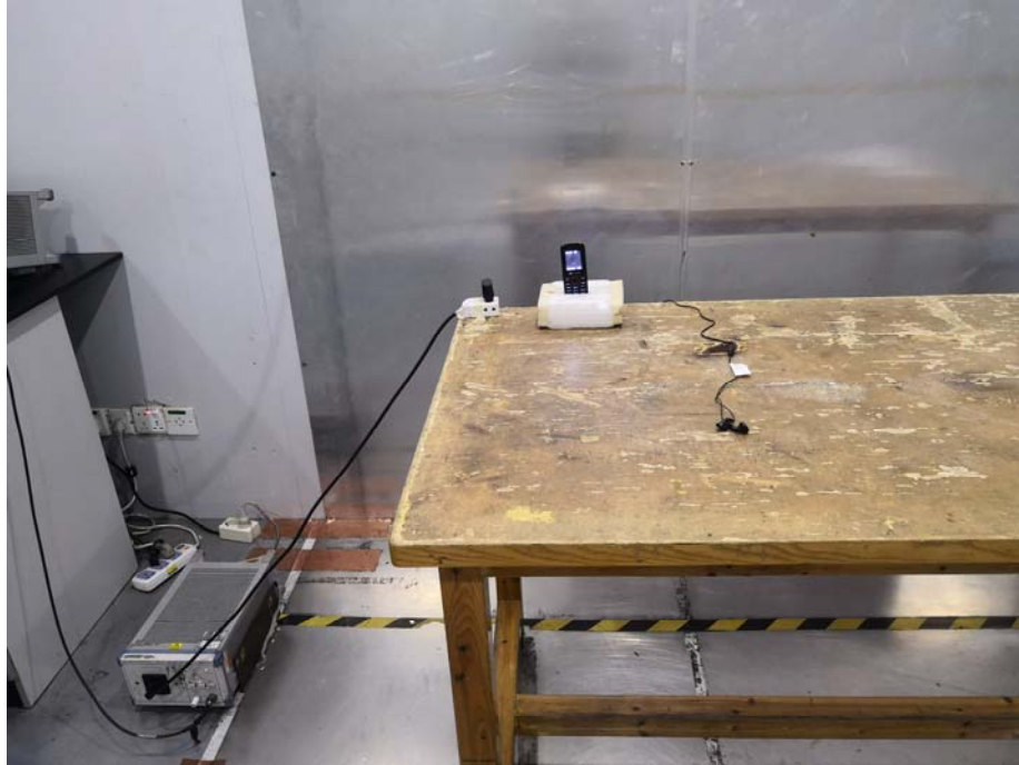
Test Site 1#