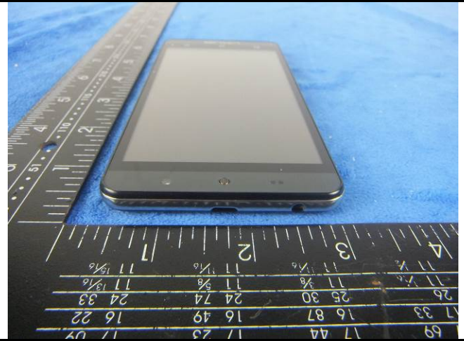
EUT - Bottom View