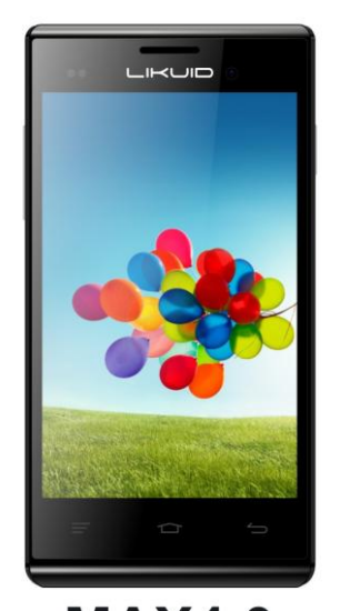
MAX4.0 USER GUIDE