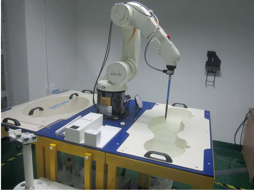
Liquid depth \geq 15\text{cm}