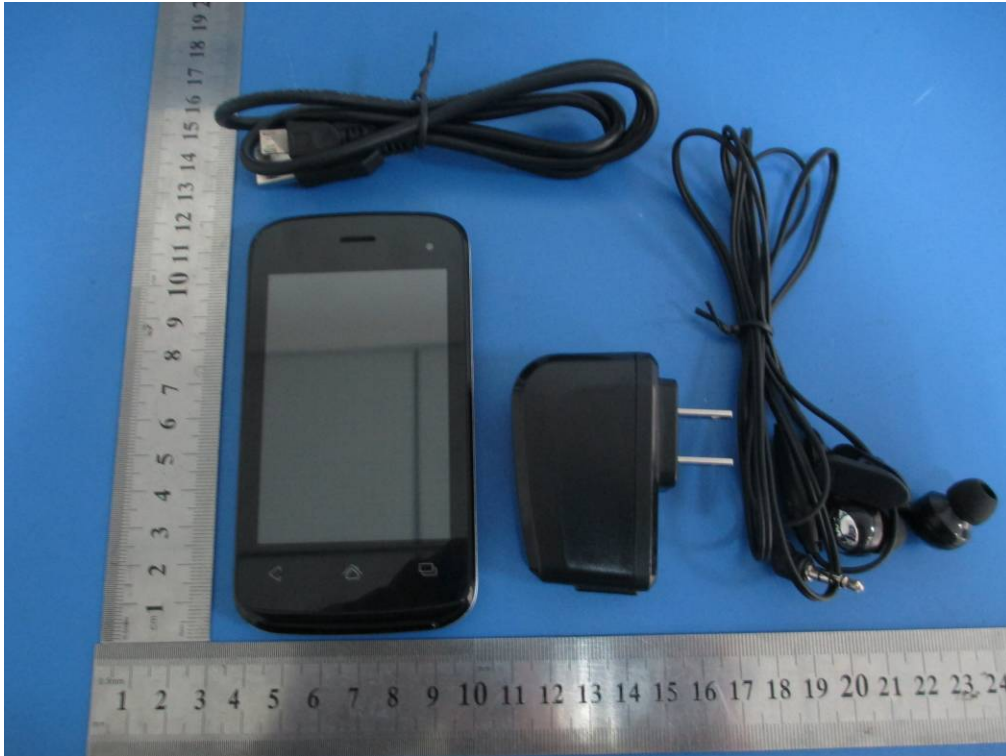
Whole Package - Top View