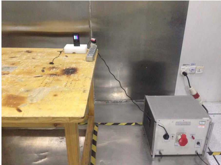
Test Site 1#