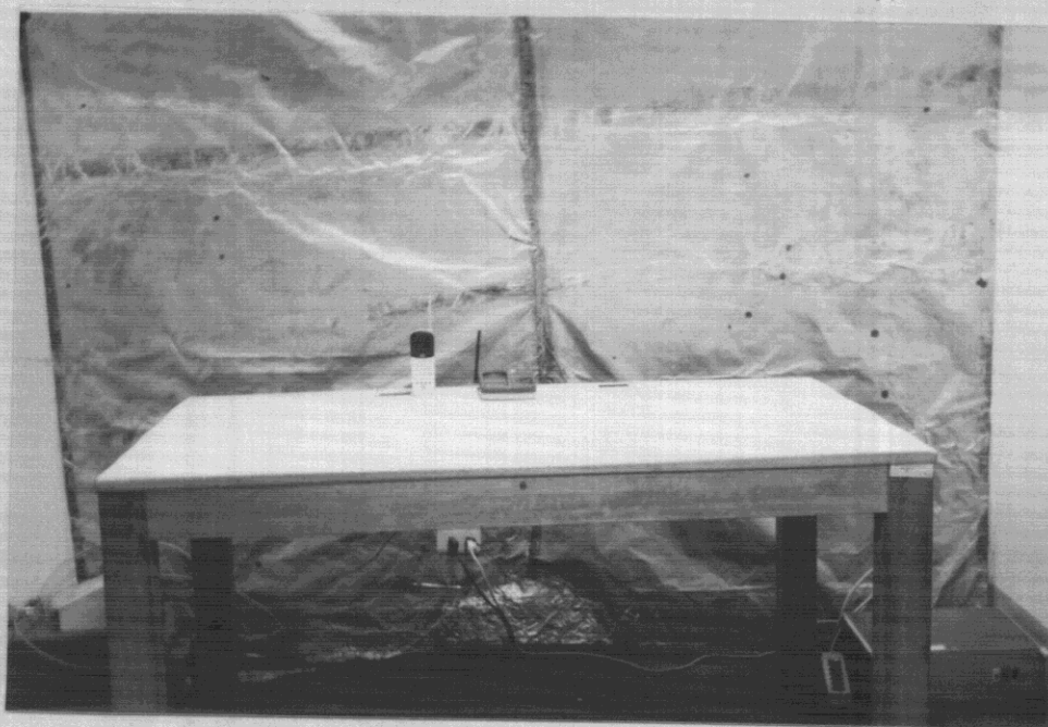
Fig. 4 Conducted emissions test placement (intercom only)