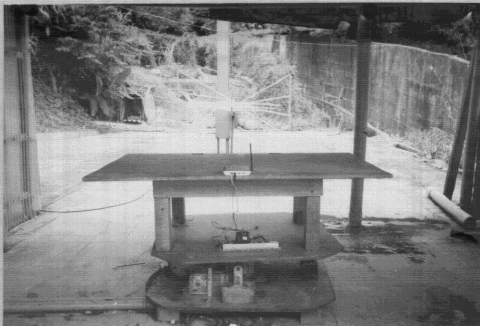
Pic 2 Rear View of the Test Configuration ( BASE )