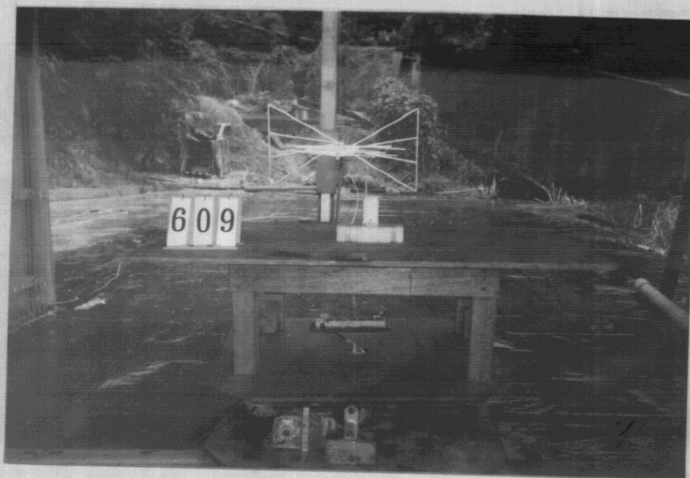
Pic 2 Rear View of the Test Configuration ( HANDSET )

* The test configuration for frequency between 1 GHz to 18 GHz is same as above .