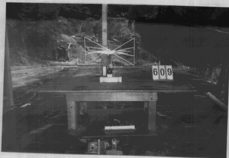
Pic 1 Front View of the Test Configuration ( HANDSET )