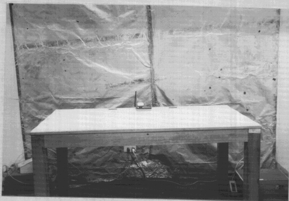
Fig. 3 Conducted emissions test placement (idle only)