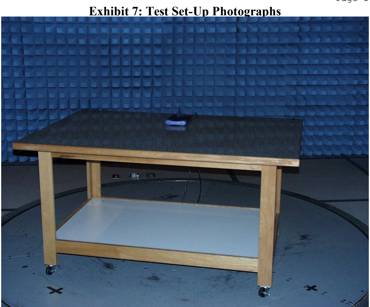
Front View of Worst Case Radiated and Line Conducted Emissions Test Set-up