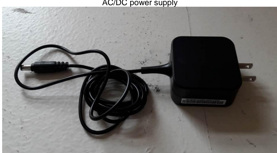
AC/DC power supply