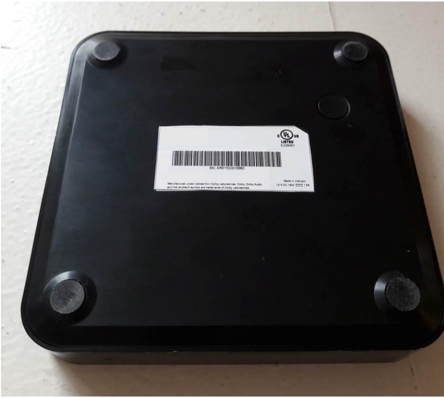
(Regulatory label not representative)