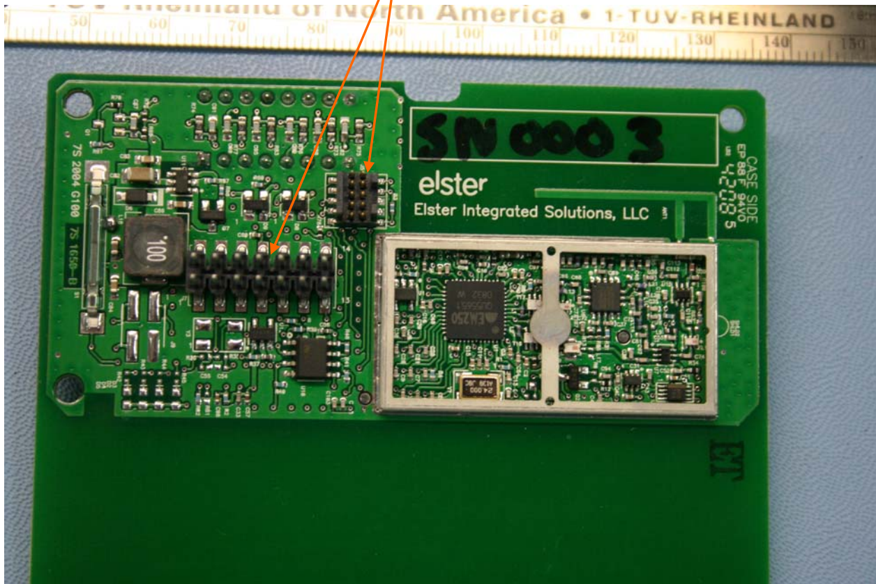
Close up Photo of Test EUT with RF shield removed

The Model submitted for testing included connectors to program the EUT for frequency and Modulation