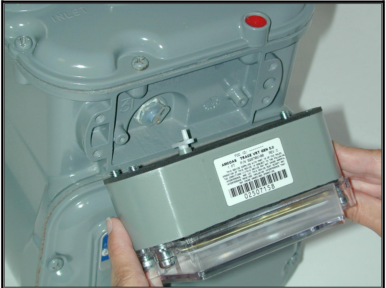
PHOTOGRAPH 1: LOCATION OF LABEL ON DEVICE

Please refer to the following page for the label sample.