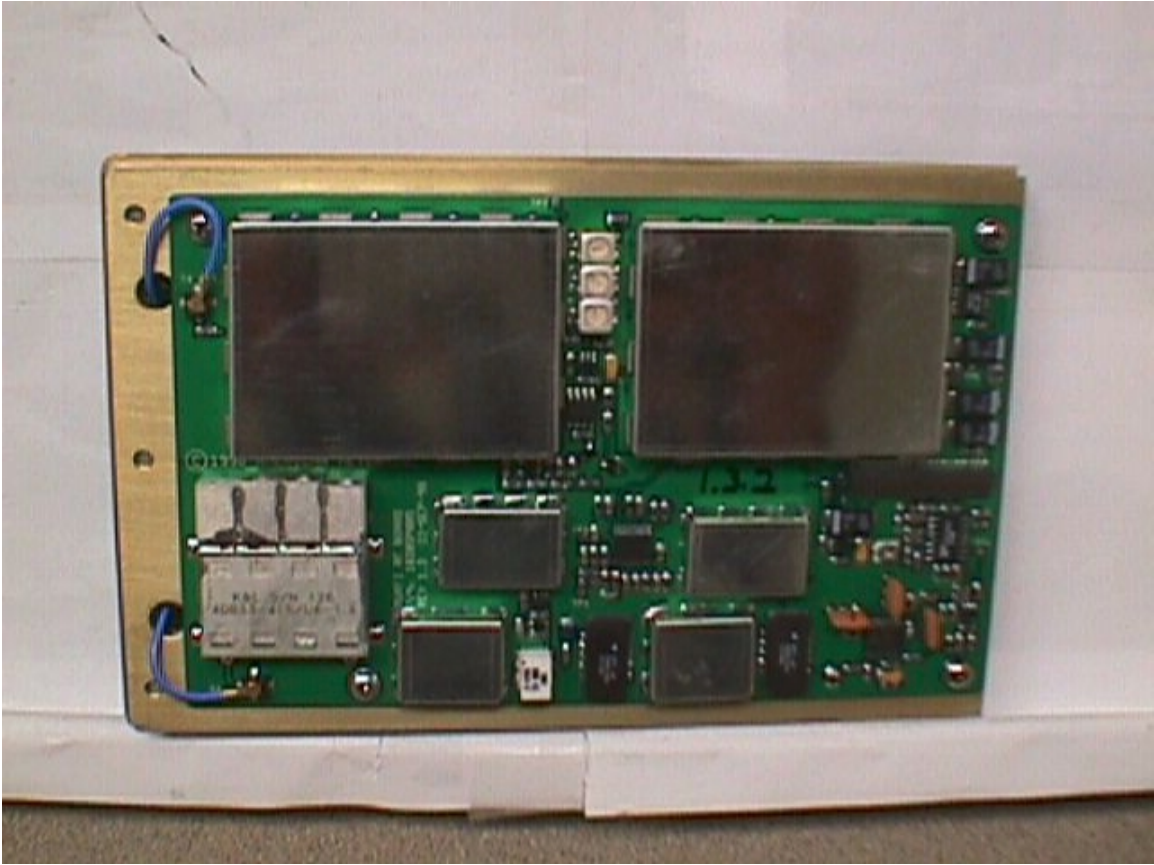
FIGURE 20: MURFI BOARD COMPONENT SIDE