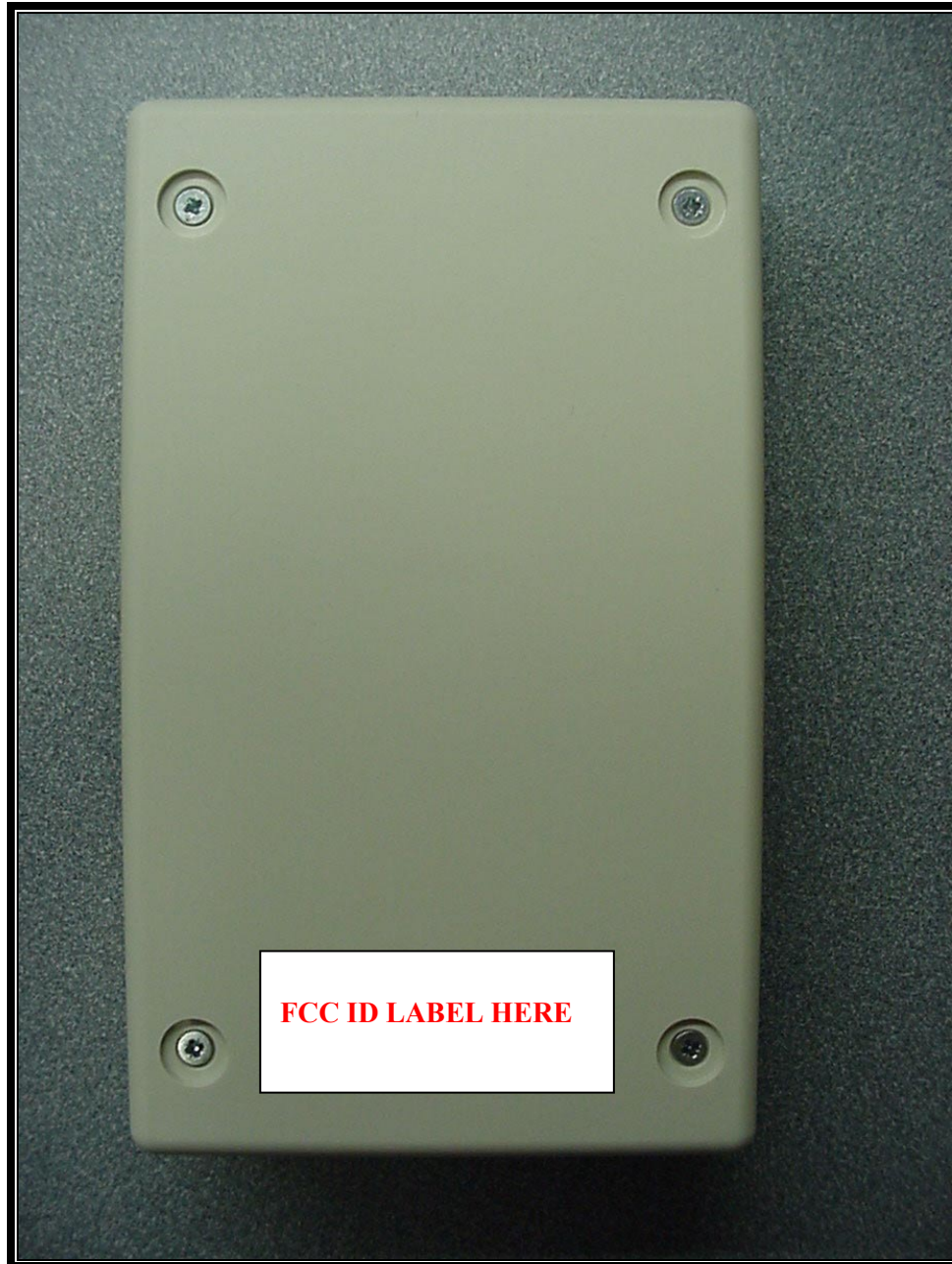
PHOTOGRAPH 2: LOCATION OF LABEL ON DEVICE

Please refer to the following page for the FCC ID label sample.