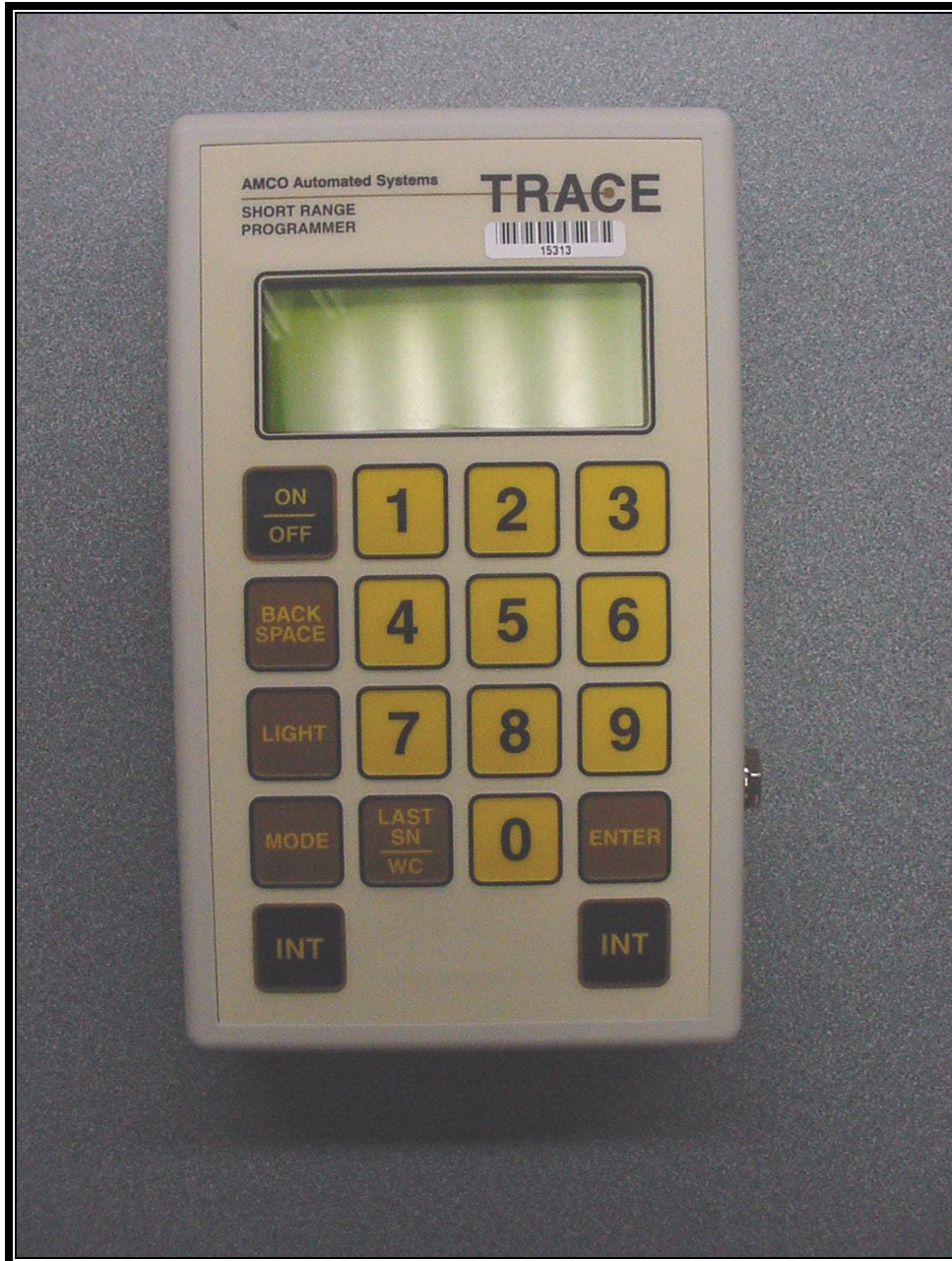
PHOTOGRAPH 7: FRONT OF EUT