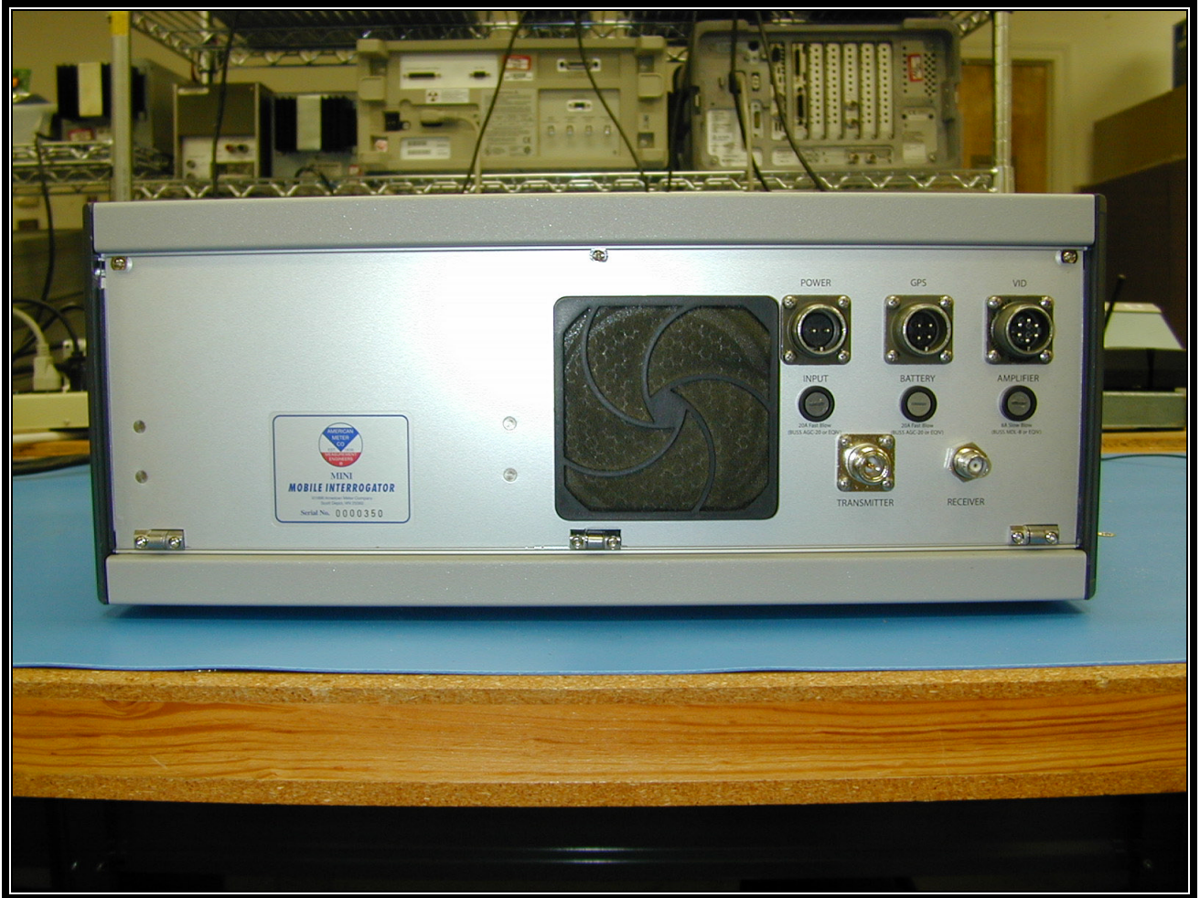
PHOTOGRAPH 4: REAR VIEW OF EUT