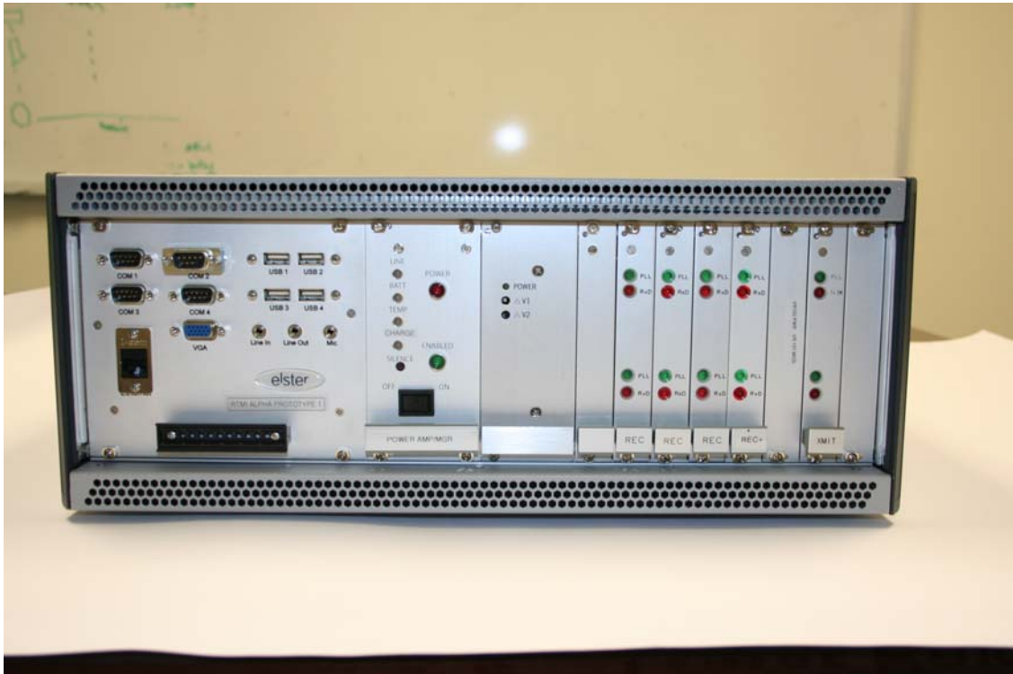
Figure 1: Front View of EUT