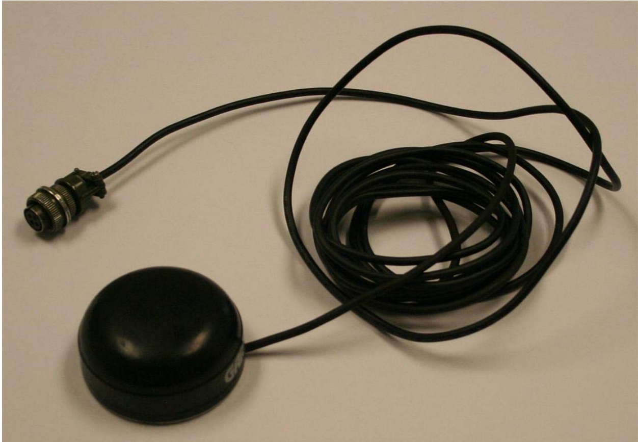
Figure 7: View of the external GPS antenna