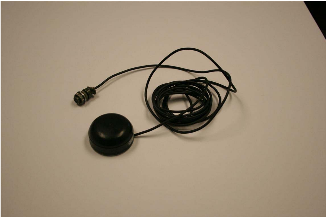
Figure 4: View of the external GPS antenna