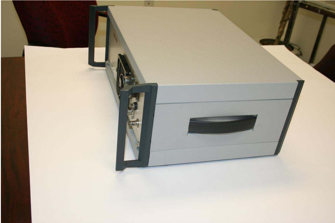
Figure 3: Side View of EUT