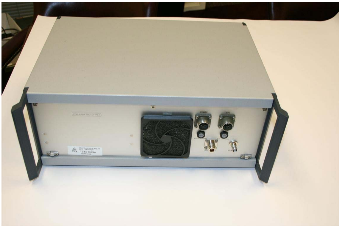
Figure 2: Rear View of EUT