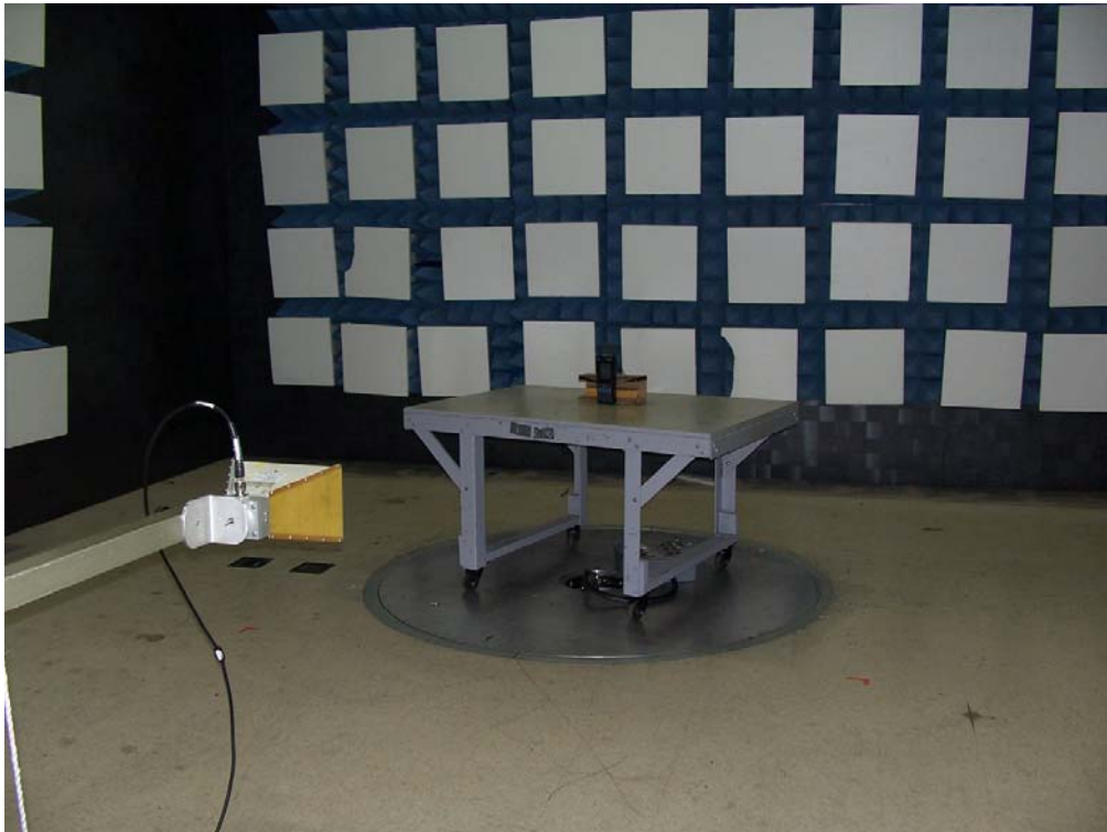
Figure 4: Spurious Radiated Emissions Setup 1 GHz to 5 GHz