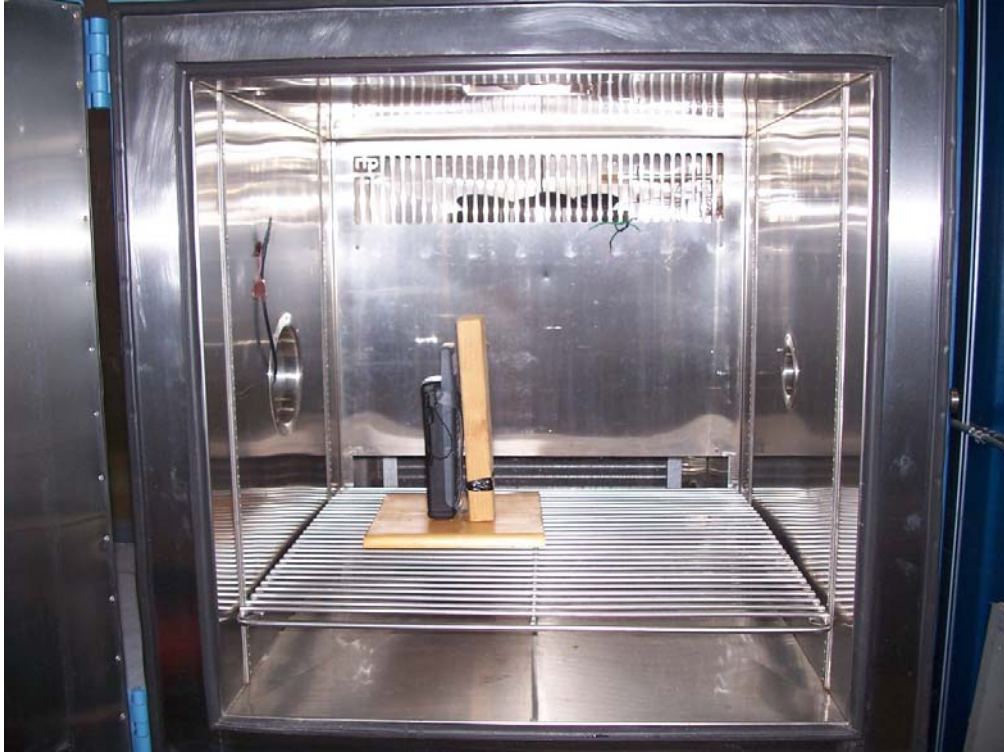
Figure 7: Frequency Stability Internal Setup