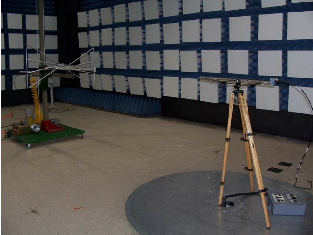
Figure 3: Substitution Method Below 1 GHz Setup