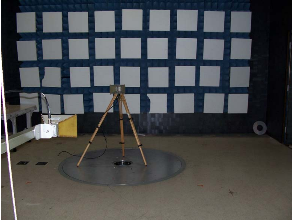
Figure 5: Substitution Method 1 GHz to 5 GHz Setup