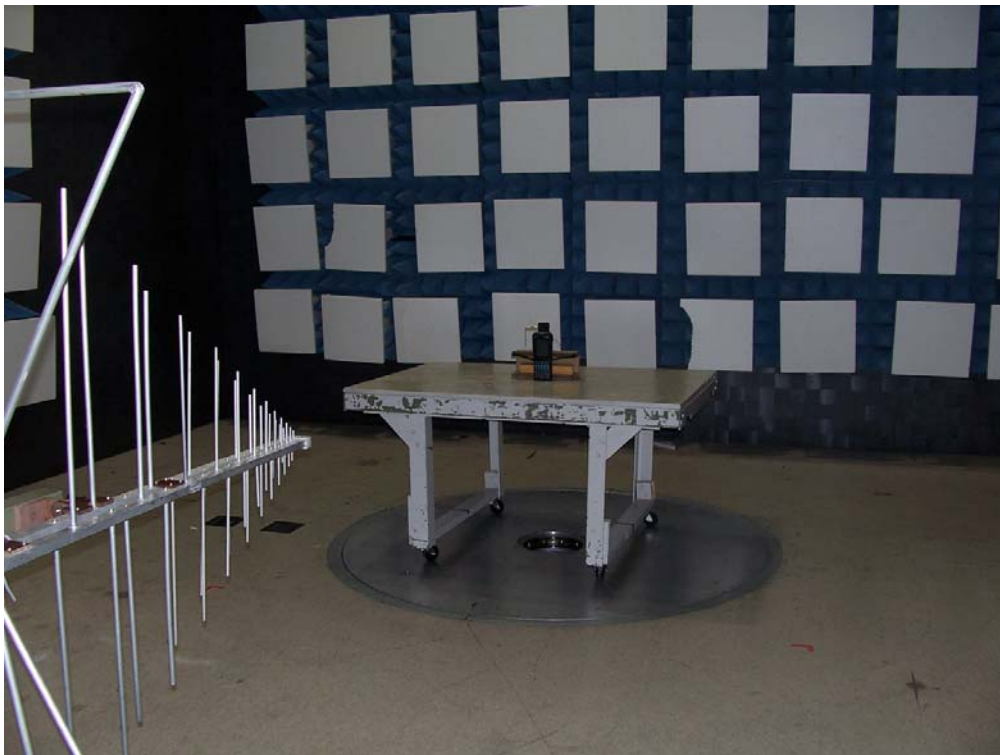
Figure 2: Radiated Emissions Below 1GHz Setup