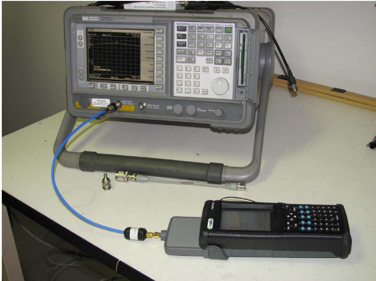
Figure 4: Direct Measurement Test setup.