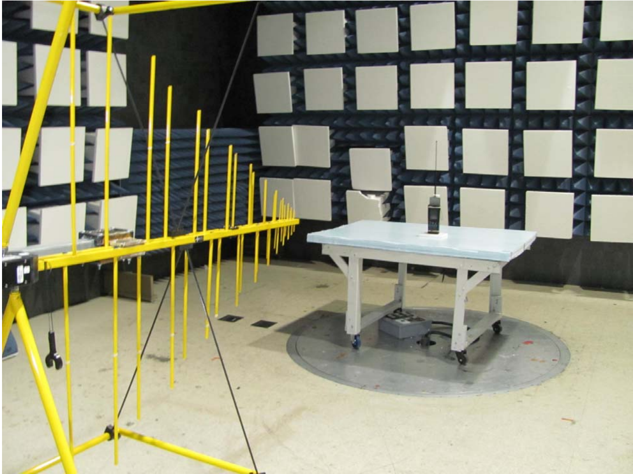
Figure 2: Radiated Emissions at 3m – 30 MHz to 1 GHz.