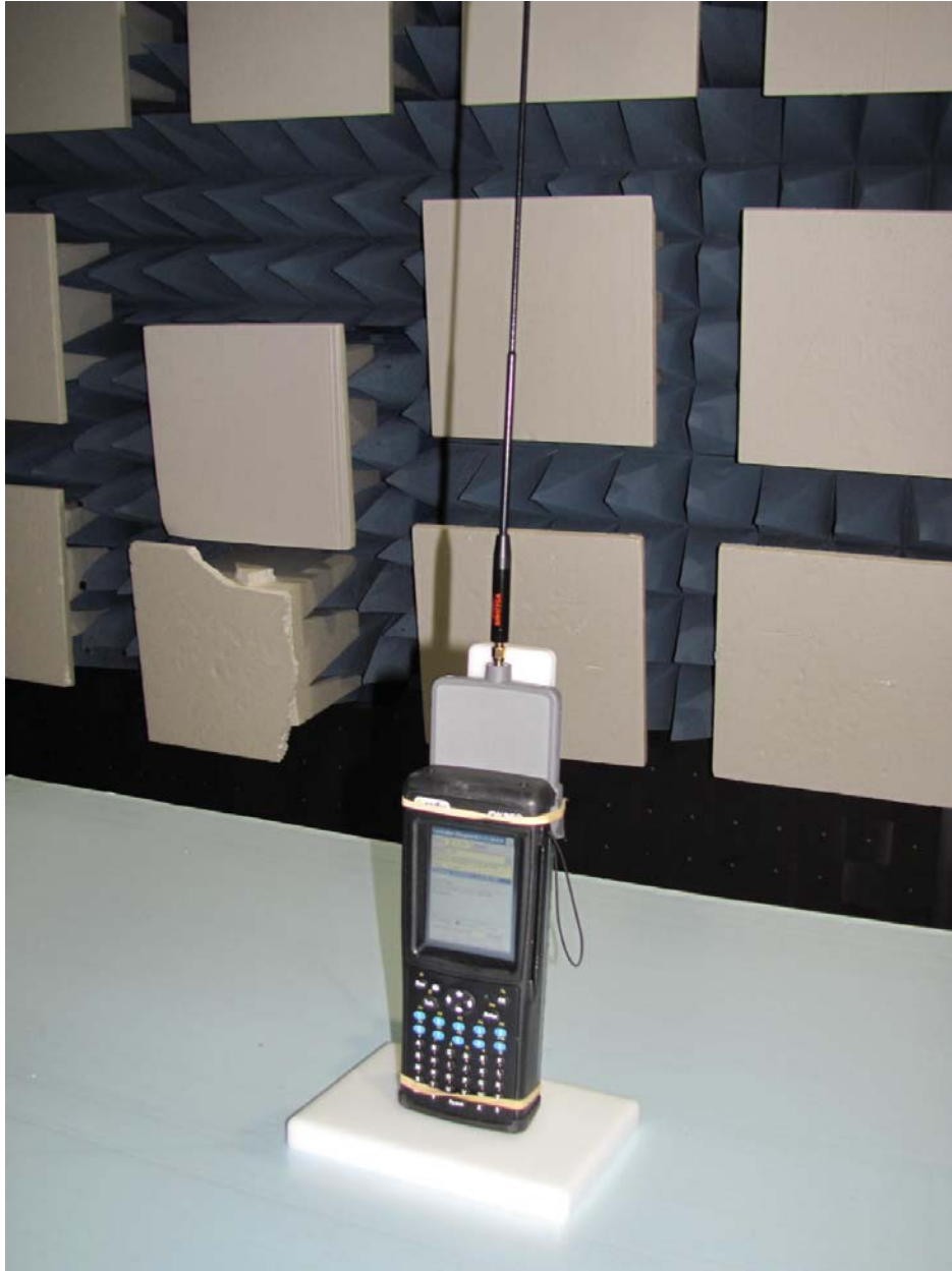
Figure 1: Close up view of Radiated Emissions Test setup in semi-anechoic chamber.