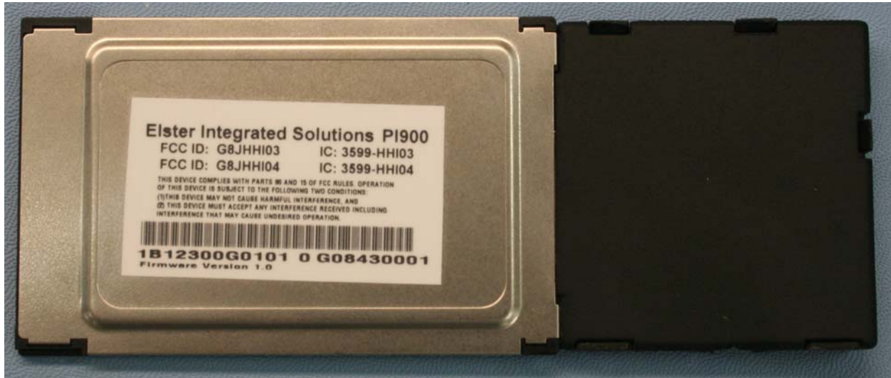
Figure 4: Top of assembly with label.