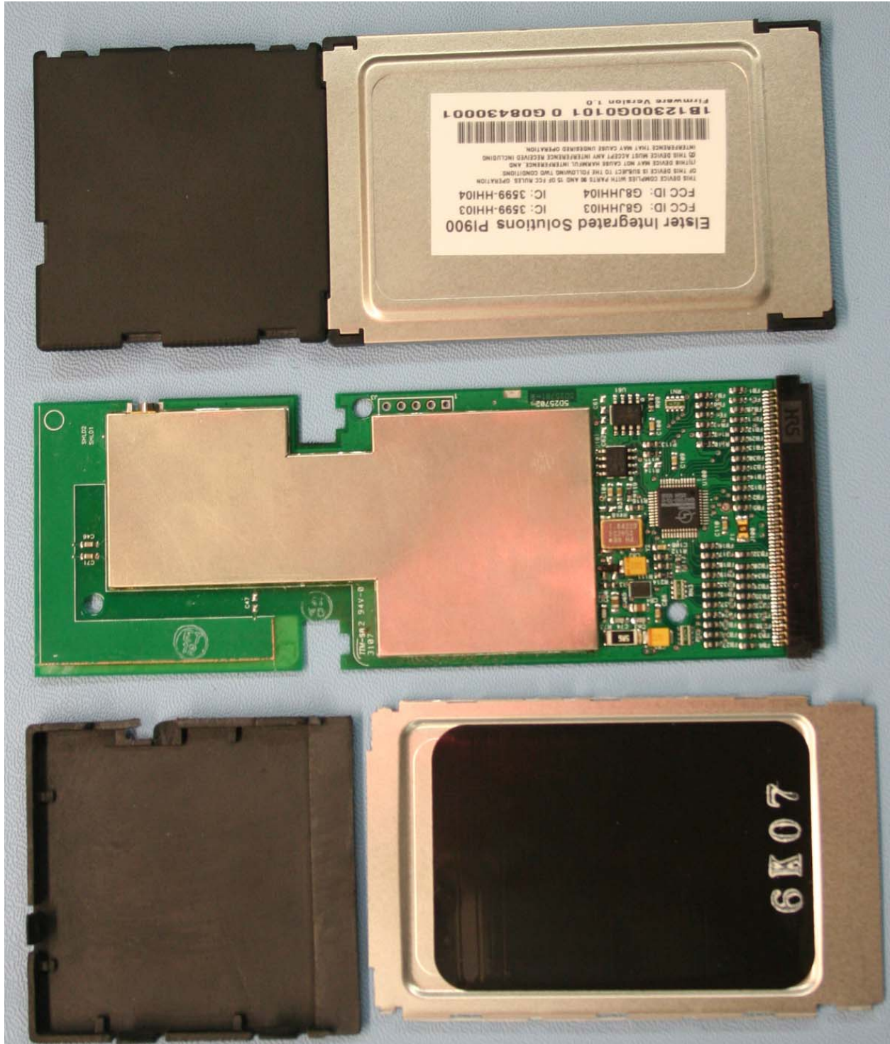
Figure 3: the PCMCIA assembly – exploded view.