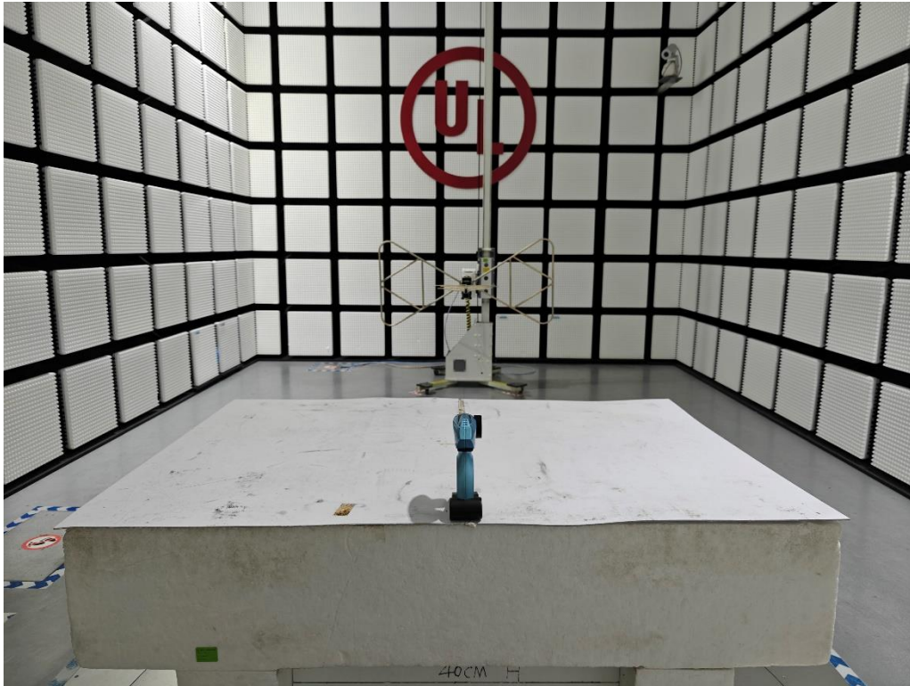
Radiated Disturbance below 30 MHz